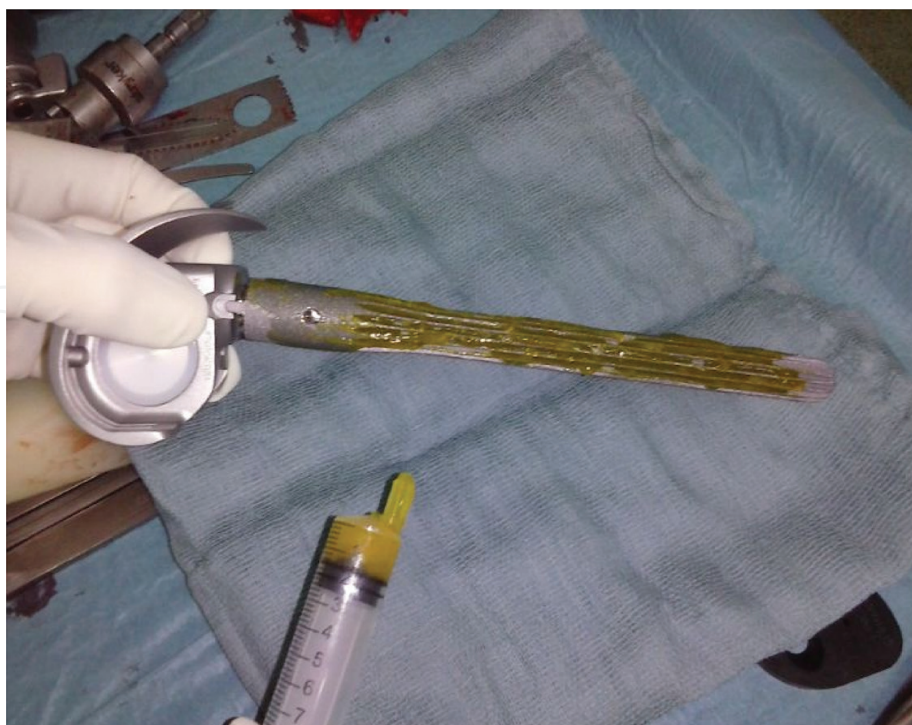
Figure 5. Tigecycline-loaded DAC ® hydrogel coating, applied at surgery on a knee revision prosthesis. The hydrogel, which comes in a powder form, in a prefilled syringe, is designed to be reconstituted at the time of surgery with water for injection. The surgeon may decide to add a single or a combination of antibiotics to the water for injection, to further enhance implant protection.

scanning electron microscopy (SEM) analysis [37]. This is an important requirement in order to reduce the exposed surface of a biomaterial, thus creating a uniform coating of the surface and leaving no pores or cracks that could eventually be colonized by planktonic bacteria.