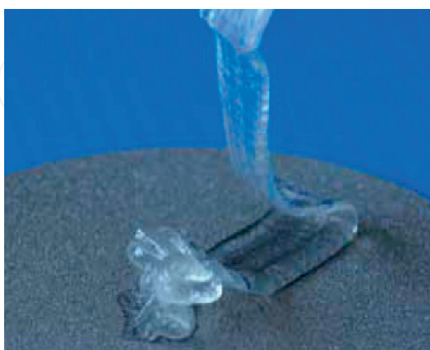
Figure 2. DAC ® HA-g-PLA, fast-resorbable, hydrogel coating. Composed of covalently linked hyaluronan and poly-D, L-lactide, the “Defensive Antibacterial Coating” (DAC ® , Novagenit Srl, Mezzolombardo, Italy) is the first antibacterial-coating cleared for clinical use in orthopedics, trauma, dentistry and maxillofacial surgery in Europe.

Composed of covalently linked hyaluronan and poly-D,L-lactide, the “Defensive Antibacterial Coating” (DAC ® , Novagenit Srl, Mezzolombardo, Italy) was specifically developed in order to protect implanted biomaterials used in orthopedics, traumatology, dentistry and maxillo-facial surgery from bacterial colonization [24, 48] (Figure 2).