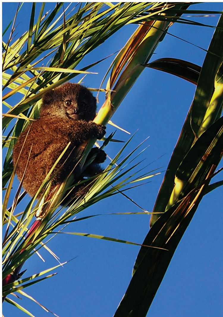
Figure 2. A juvenile Hapalemur alaotrensis , with permission from photographer Arnaud De Grave, Le Pictorium Agency.

social behavioral trait common in many lemurs [54], and has a specialized diet based on marshland vegetation only [53] and it is well adapted to wetland conditions [51]. Hapalemur alaotrensis is the only primate species in the world that lives exclusively in a wetland habitat. The species is classified as Critically Endangered [55] due to its very restricted geographic range. Hapalemur alaotrensis is at high risk of extinction due to rapid and ongoing habitat destruction for conversion of the marsh to rice fields [56]. The marshland coverage was around 19,000 hectares in the early 2000s and it has decreased to below 14,000 in the mid-2000s; in 2012, there was an extreme fire year affecting more than 50% of the remaining marshes [57]. There are two factors leading to increased marshland burning: lack of law enforcement and prolonged drought seasons. For example, a single rice field was found within the Park Bandro at Andreba in 2013, but this increased to five rice fields in 2014. People in Andreba stated that they will transform the marsh into rice fields if the current delinquents are not punished. A census of Madagascar Wildlife Conservation (MWC), a Malagasy NGO, revealed that in 2016, a fourth of the park was covered with illegal rice plantations [58].