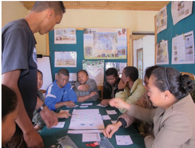
Figure 6. Wetland discussion game: regional authorities implementing a self-developed rule during testing phase.

users but also school children, and judged the game to be realistic, instructional, enjoyable, and suitable to enter into fruitful discussions. It still remains to be tested whether this game approach can increase the acceptance of already existing conservation rules in the real Alaotra socioecological system.