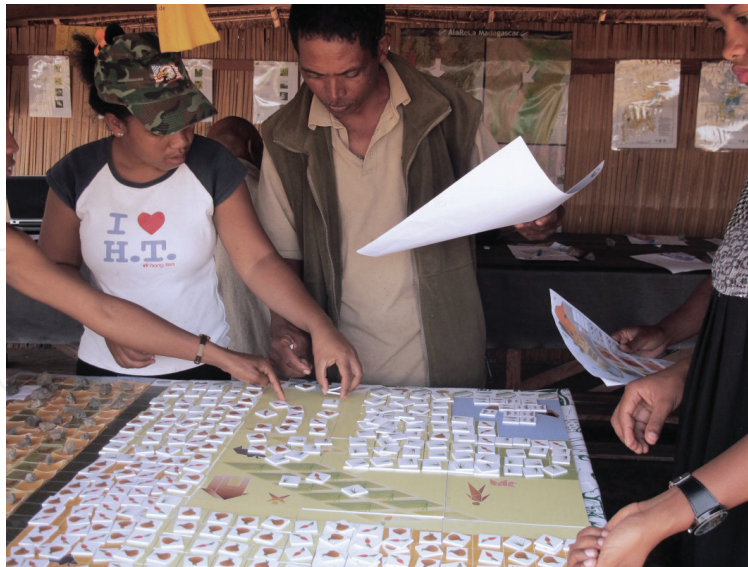
Figure 4. Wetland research game: players track how their individual decisions accumulate on the common landscape.

for freeing emotions and understanding what happened during the game, in order to then bridge the virtual game reality with the real world. Important to note here is that game behavior does not necessarily reflect reality; the game behavior serves as entry point to compare game activities and real life. It also frees people of the social constraints that are often accompanying people during an interview or open discussions on topics of potential conflict. A follow-up monitoring 1 week after the workshop allows researchers and players to exchange one by one on further details and thoughts concerning the issue at stake. Participants acknowledged the opportunity to openly discuss land-use strategies and decisions and appreciated the fact that they could also exchange controversial ideas in the workshop setting without entering in disputes. Several gamers perceived that the game offered them a new, broader perspective on their surroundings and the ongoing processes in reality. They further described in the debriefing sessions that game behavior matched real-life behavior from about 50 to 100% and thought that the gaming experience would help them to make better decisions in the future.