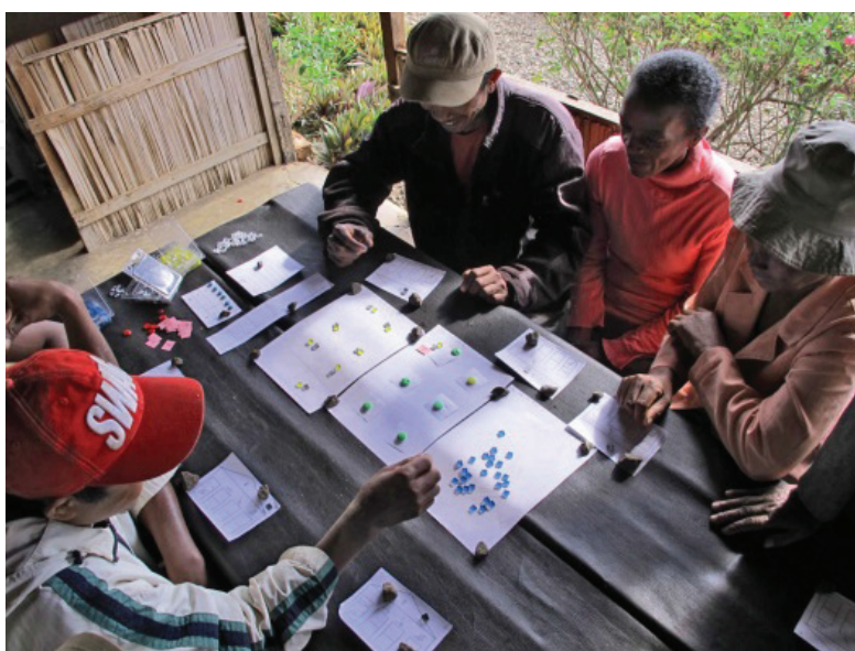
Figure 5. Wetland discussion game: prototype representing lake, marsh, and agricultural zone.

First results suggest that people tend to intensively (over)exploit the system if they have the opportunity to do so. The players quickly establish new effective game rules, which show high similarity to already existing conservation rules. The strength of the game is that the participants can discuss prerequisites, advantages, and disadvantages of different potential rules and then decide themselves which one to try out. During the testing workshop debriefings, participants emphasized the interdisciplinary nature of the game, its suitability for rural resource