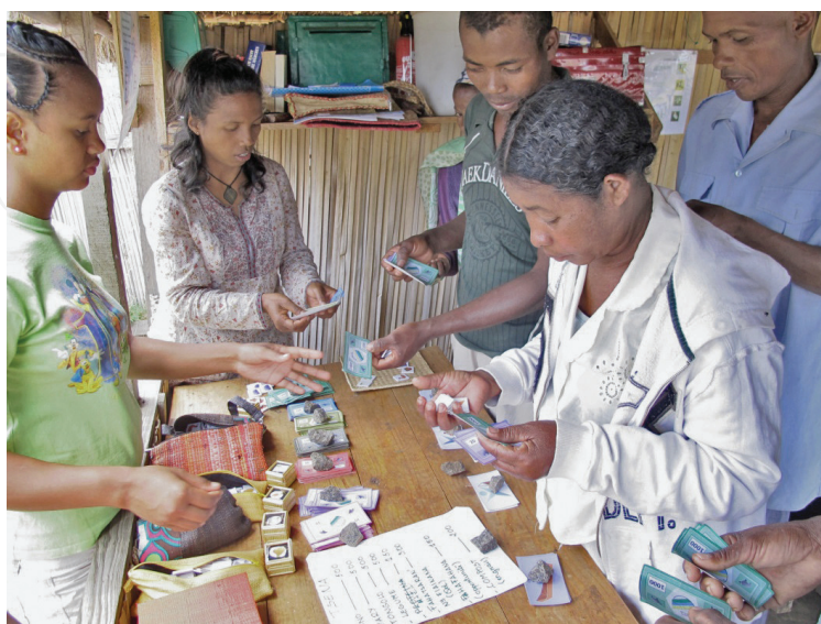
Figure 3. Wetland research game: players buy activities at the market.