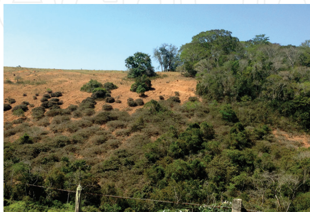
Figure 4. Natural regeneration nuclei in degraded pasture.

The ecological principle of seedling planting in nuclei is the realization that in many situations of degradation of terrestrial ecosystems, succession does not begin simultaneously, covering all the abandoned area, a pasture, for example, but generally small nuclei of pioneer facilitating species of succession are formed, which expand over time ( Figure 4 ). In their study [39],