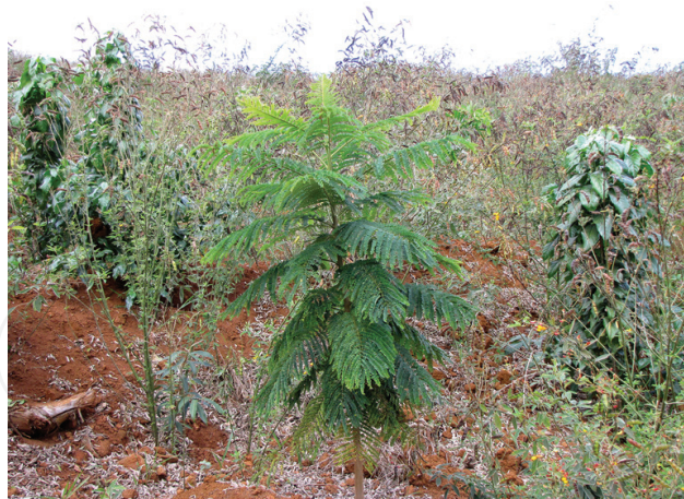
Figure 6. Forest restoration of mined areas with random planting of seedlings and direct sowing of Cajanus cajan (L.) Millsp. Forest restoration project LARF-UFV.

A detailed study on the viability of direct seeding as a forest restoration technique is found in [46]. In it, the authors discuss very satisfactory results of the application of a new mechanized direct seeding methodology adopted in a large scale in the state of Mato Grosso, Brazil, in which seeding agricultural machines were adapted for seed sowing of native species. In addition, they present a review with excellent results of experiments of direct seeding of different species in the Brazilian biomes.