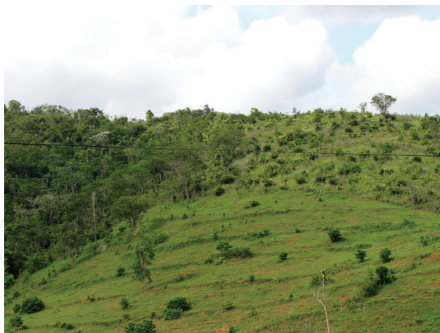
Figure 2. Extracts with different regeneration potentials; in the upper part of the slope (A), only the enrichment with planting of seedlings in nuclei in the regeneration faults was indicated; in the lower part of the slope (B), the planting in smaller spacing, always maintaining the regenerants, was pointed.

installed at intervals of 20–50 m, birds can move and disperse fruit seeds that they used in forest fragments still existing in the landscape. With the installation of perches in the reforestation, larger spacings can be adopted inasmuch as nuclei of natural regeneration tend to be formed around the perches.