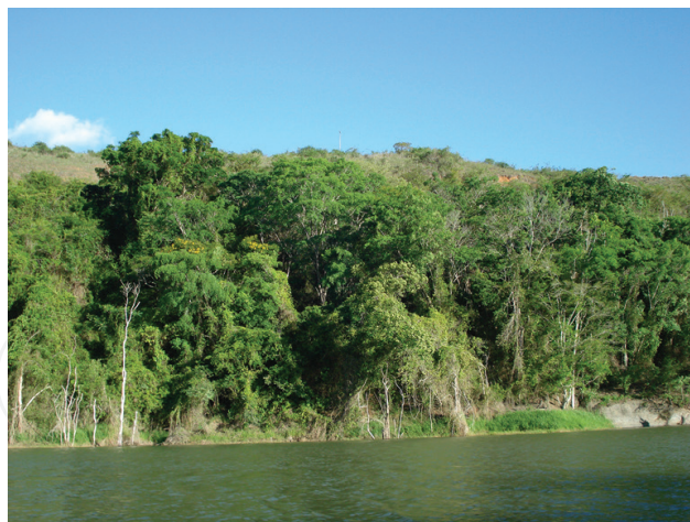
Figure 3. Restored ciliary forest by means of natural regeneration. Forest restoration project LARF-UFV.

As regeneration depends on three basic ecological mechanisms—seed rain, soil seed bank, and regrowth of vines and roots—in very anthropic landscapes, with a long history of intensive use only for agriculture or livestock and with forest remnants absent or very isolated and degraded, this process may not occur or be extremely slow.