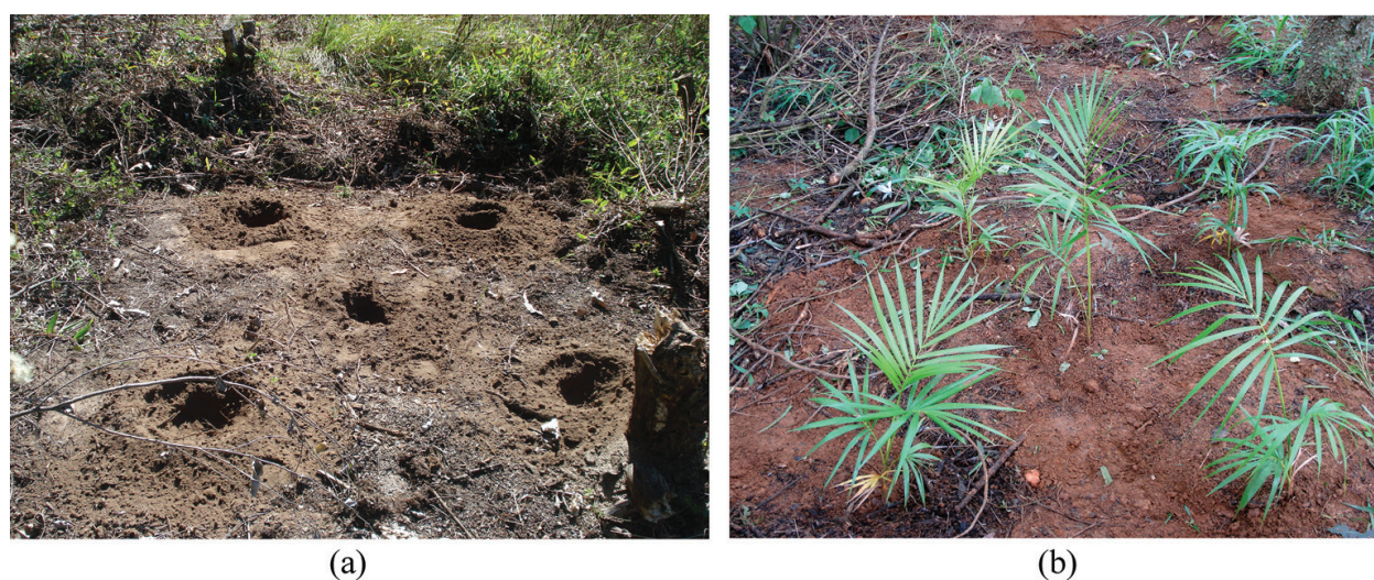
Figure 5. The nucleus of pits for planting and Euterpe edulis Mart. Seedlings planted in an enrichment nucleus. Forest restoration project LARF-UFV.

The planting in nuclei also allows a single crowning for the nucleus as a whole, that is, for the five seedlings, which represents a strong reduction in the costs of implanting and maintaining restoration projects, since the crowning around the seedlings in many regions where herbicide application is not accepted by environmental agencies is the only way to avoid competition with aggressive exotic grasses.