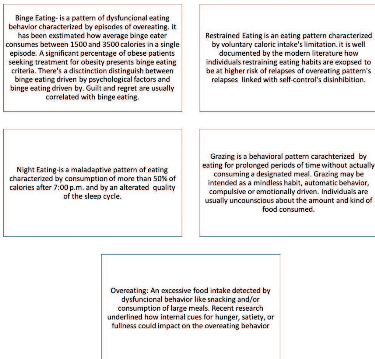
Figure 2. Dysfunctional eating behaviors.

Scientific literature is full of examples about how interventions exclusively aimed at weight loss results in bankruptcy over time, with a regaining of the weight lost during hospitalization within 3 years [5, 6]. It becomes clear that the multifactorial nature of this pathology requires multidisciplinary interventions, able to combine the different needs and urges of each individual, from a clinical, psychological, and social perspective. Psychological factors, in particular, influence both weight loss and, more importantly, long-term weight loss maintenance. Cognitive-behavioral