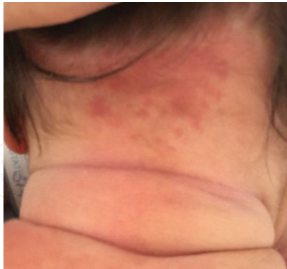
Figure 8. Capillary hemangioma – Posterior neck.

The treatment can be surgical and dermatological-medical and may consist of the surgical excision of hemangiomas, laser pulses, cryosurgery and systemic administration of glucocorticoids. Oral propranolol may be administered in order to reduce the size of hemangiomas may be a therapeutic option [47].