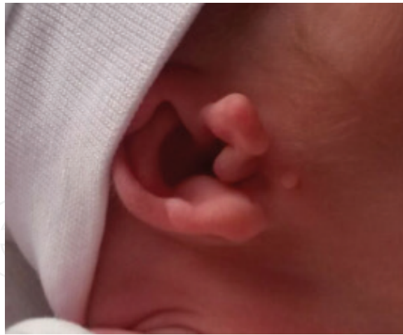
Figure 6. Preauricular tag.

Auricular fistulas are small pits/openings, located anywhere at the anterior margin of the auricle, from crus of the helix to helix, and are lined by squamous epithelium.