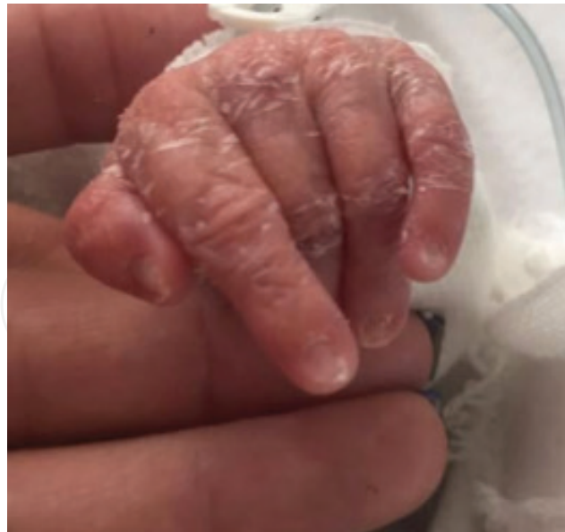
Figure 11. Clinodactyly of the fifth finger.

Considering the presence of this sign in multiple chromosomal anomalies, some authors consider it a “soft sign”, if detected in an antenatal ultrasound scan.