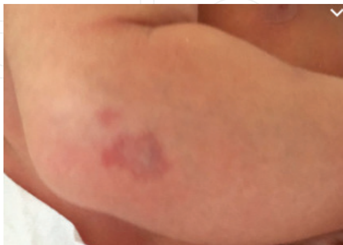
Figure 9. Capillary hemangioma – Forearm.

Mongolian Spots, also known as Mongolian Blue Spots or congenital dermal melanocytosis, represent a congenital condition characterized by the presence of smooth spots, irregular-shaped with wavy borders, dark blue to brown, with a normal skin texture [48]. They may be present from birth or may appear within the first few weeks of life during the neonatal period.