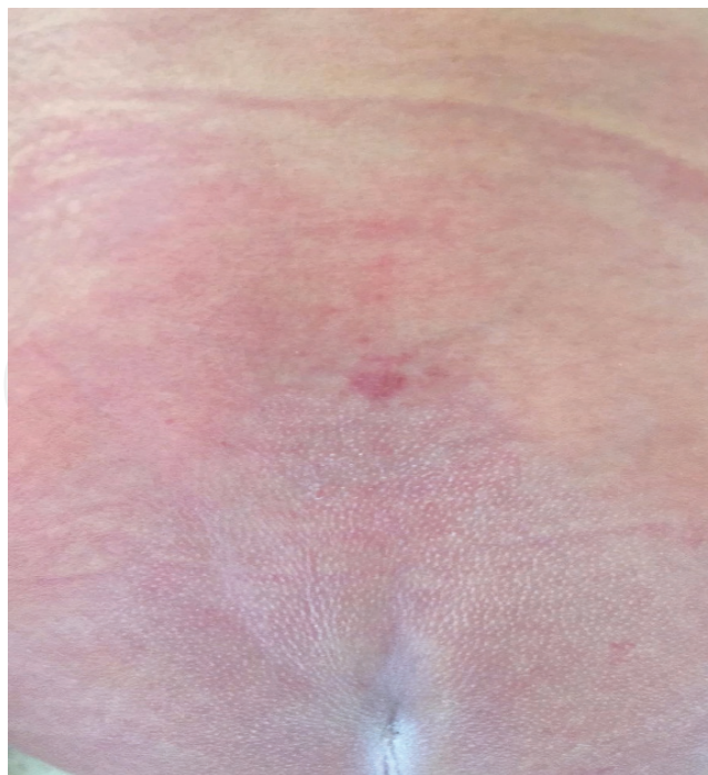
Figure 10. Mongoloid spot – Lumbosacral region.

No treatment is recommended, as Mongoloid spots generally disappear spontaneously at the age of 1–4 years, most frequently in the first year of life. If they do not disappear until puberty, they remain permanent, a situation that occurs in approximately 5% of cases [51].