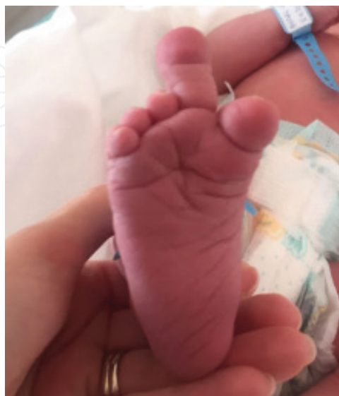
Figure 12. Phalanx anomalies.

There are many disorders – some genetic, some neoplastic, some inflammatory – which sometimes produce extraordinary changes in the patient's feet. In some cases, phalanx abnormalities occur as a result of the sucking of the finger by the fetus, causing elongation and hypertrophy (Figures 12 and 13).