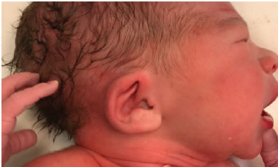
Figure 7. Bilateral macrotia with abnormal shape of the auricle.

Capillary hemangiomas are prone to irritation and ulceration. Each lesion must be evaluated individually, and the practitioner may opt to treat it selecting an alternative therapeutic route.