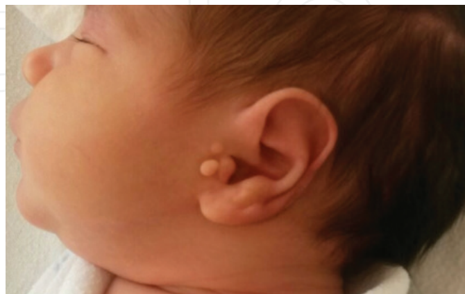
Figure 5. Preauricular tag.

Auricular fistulas are small, pigmented, benign congenital formations [26], located in the tegument and auricular and periauricular soft tissues, anywhere along a line drawn from the tragus to the angle of the mouth. They were first described by Van Heusinger in 1864.