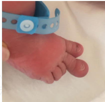
Figure 13. Phalanx anomalies.

A small listing includes synovial chondromatosis, fibrous dysplasia, tumoral calcinosis, Maffucci syndrome, Ollier's disease, hereditary multiple osteocartilaginous exostosis, type 1 neurofibromatosis, pigmented villonodular synovitis, hyperparathyroidism, or gout.