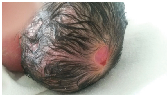
Figure 1. Aplasia cutis congenita.

Aplasia cutis congenita (ACC) is the congenital absence of the skin, and may occur on any part of the body. It affects the scalp in 70–80% of the cases ( Figure 1 ), either as solitary lesions or associated with skull and dura mater defects [2, 7]. Aplasia cutis congenita is a rare anomaly in neonates. Over 500 cases have been reported since the first description, by Cordon in 1767. Due to the unreported cases, their real incidence is unknown. An estimate of the incidence is about 3 out of 10,000 births [8].