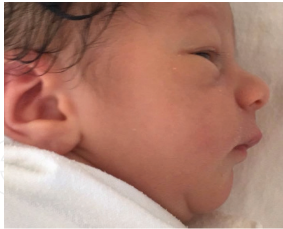
Figure 2. Mild micrognathia associated with retrognathia.

It can appear as a minor and isolated abnormality, or may be severe, as part of a genetic syndrome, frequently causing postnatal complications.