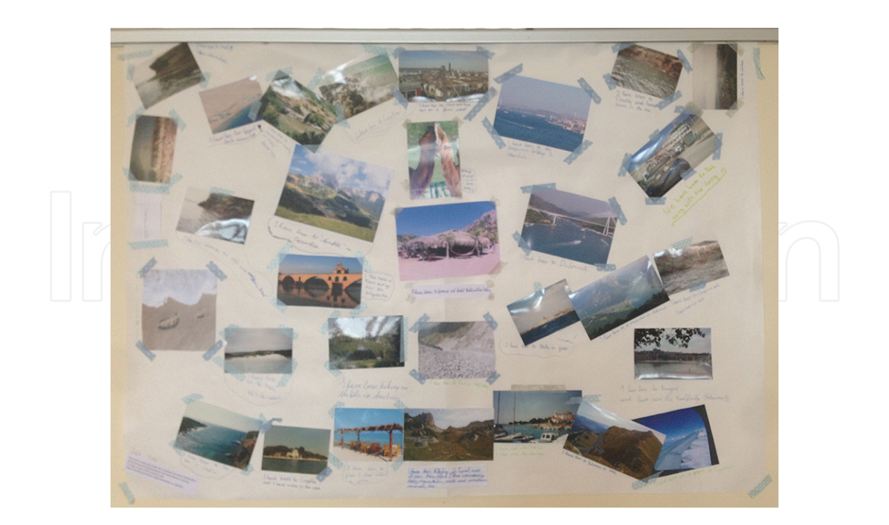
Figure 2. Class poster.

prior written permission needed to be obtained, the license was chosen beforehand. However, the students were involved in the naming process, that is to say that the class as a whole chooses the author name under which the poster was released.