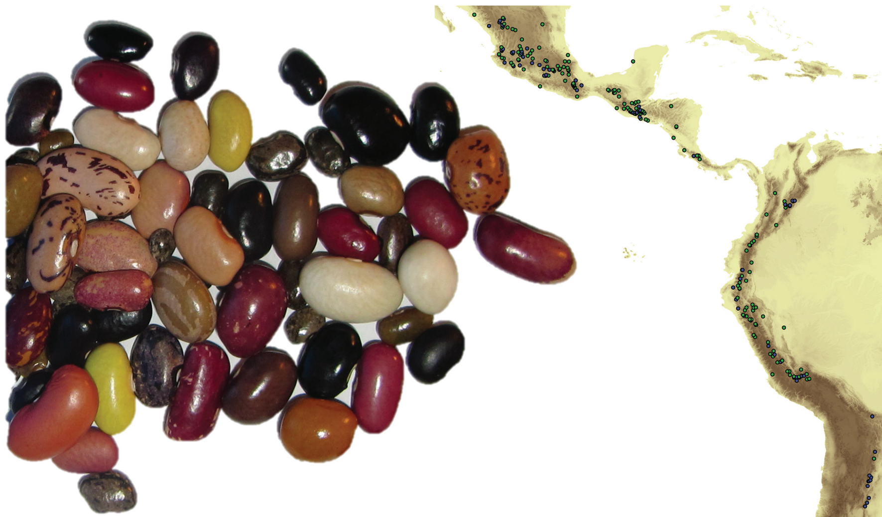
Figure 1. Geographic distribution of wild relatives (light gray) and landraces (dark gray) of common bean and its diversity in terms of seed size, colors, and patterns. Modified from Cortés et al. [12].