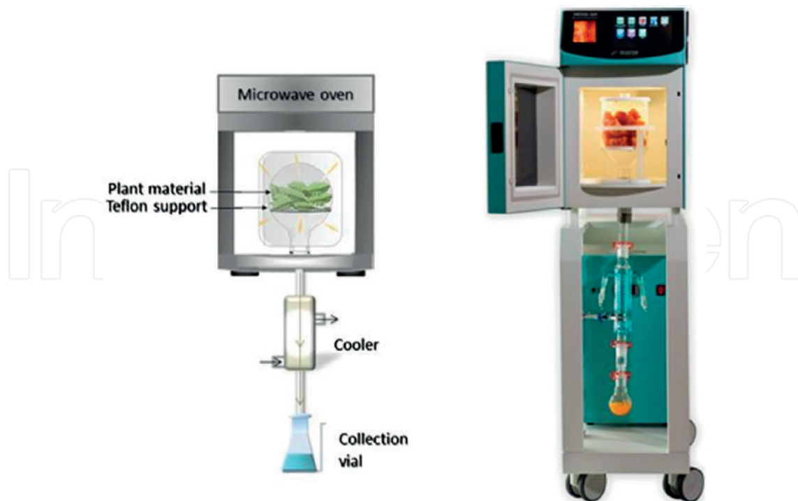
Figure 2. Microwave hydro-diffusion and gravity (MHG) [30].