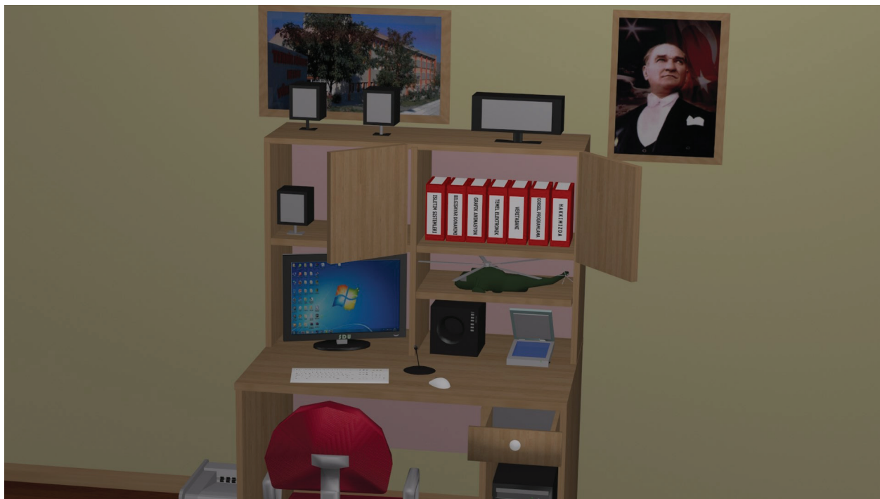
Figure 3. Opened bookcase door view for getting special file view.

The students' perceptions about CHG is analyzed with semistructured interview method. According to the interview data, playing game is funny even if it is being about course content according to students, and students also mentioned that they liked 3D content and the game. According to instructors' perceptions, the game increased students' motivation as being the students are in the race with the game to gain the highest score. As a proposal for a new version of CHG given from students is multi-player version of the game can be developed.