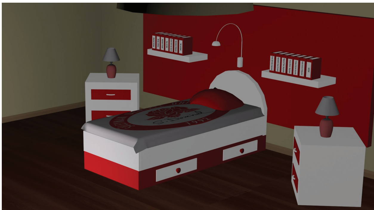
Figure 2. Teen room view.

In CHG, a teen room was designed considering digital natives preferences ( Figure 2 ). A worktable and course books were added in the CHG room. In the computer hardware book, computer technical parts such as mainboard, processor, hard disk, RAM, video card, DVD-ROM, and