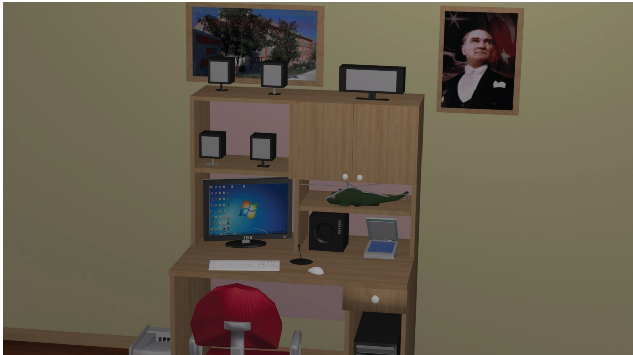
Figure 1. Computer hardware game view.

In CHG, a teen room was designed considering digital natives preferences ( Figure 2 ). A worktable and course books were added in the CHG room. In the computer hardware book, computer technical parts such as mainboard, processor, hard disk, RAM, video card, DVD-ROM, and