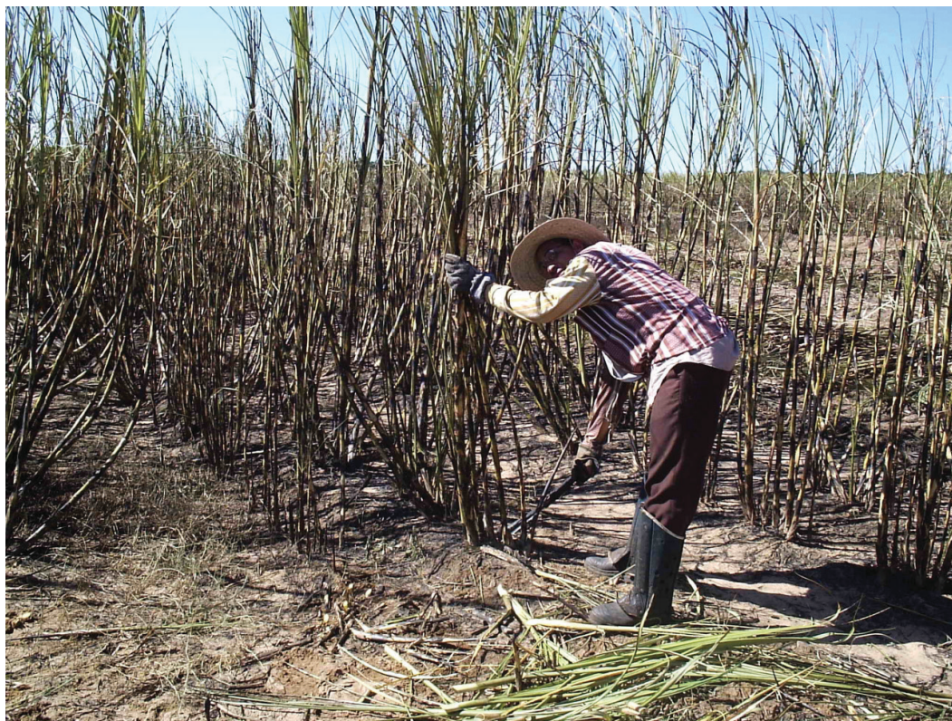
Figure 3. Hand sugarcane harvesting.