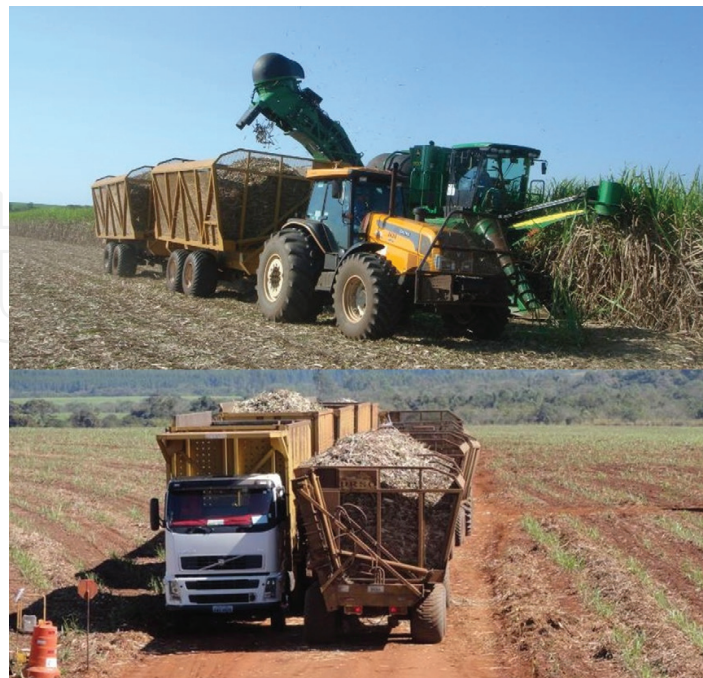
Figure 5. Transshipment to aid the transport of sugarcane from the plot to the truck or train.

Sugarcane has a great economic importance in Australia. According to Higgins and Davies [31], in this country, the sugarcane is mostly concentrated in the northeast, and the cut begins in the winter and goes until the end of spring, when the highest percentage of sucrose is concentrated.