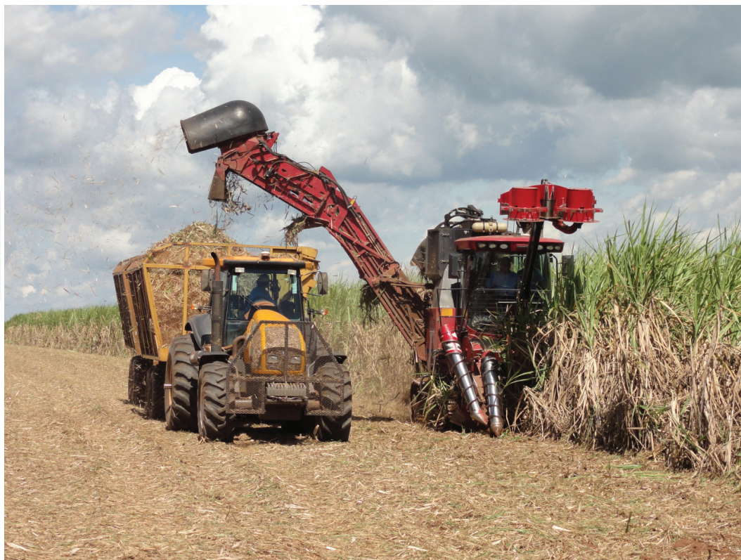
Figure 4. Sugarcane mechanized harvesting.