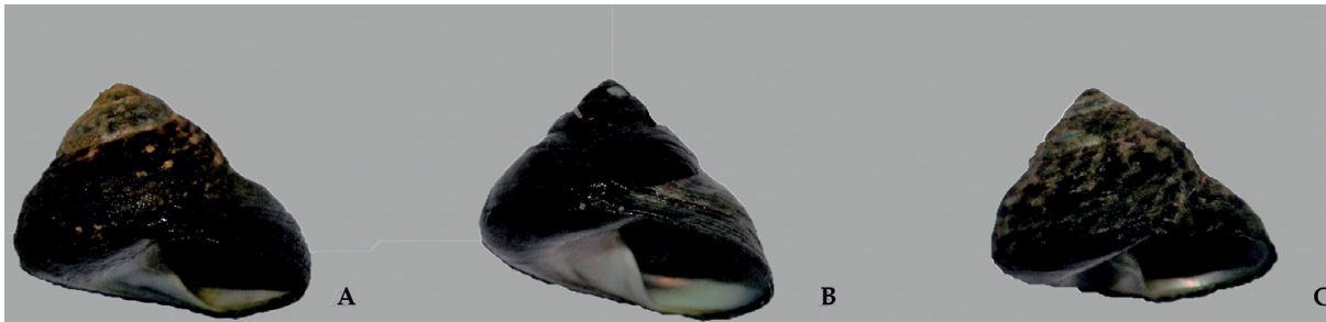
Figure 1. Shell phenotypic variability of Phorcus sauciatus . A – Portugal mainland, B – Madeira Island, C – Gran Canaria Island.

and papillate tentacles, cup-shaped open eyes on distinct stalks, a foot, a muscular ventral organ with a flattened base used for locomotion, and a visceral mass, which fills dorsally the spire of the shell and contains most organ systems and the mantle, a collar-like tegument, which lines and secretes the shell, and forms a mantle cavity normally provided with respiratory gills for breathing in water and a well-vascularised mantle cavity, which allows the animals to breathe in air [13, 14].