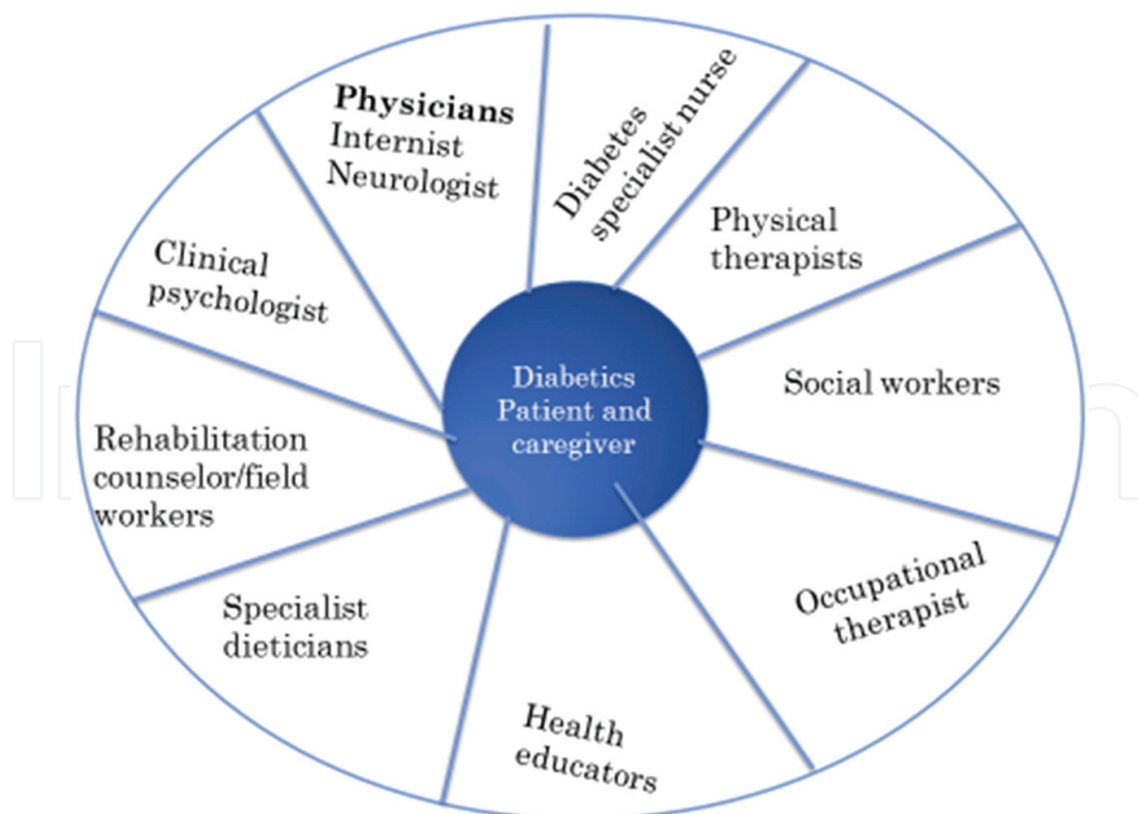
Figure 1. The multidisciplinary rehabilitation team approach centres on the patient and caregiver.

Physical therapy is a thus corner stone of prevention and treatment of diabetes mellitus. Physical therapy-directed movement and exercise programs are clinically effective in helping diabetic patients to produce the desired health-related quality of life (HRQOL) outcomes [11].