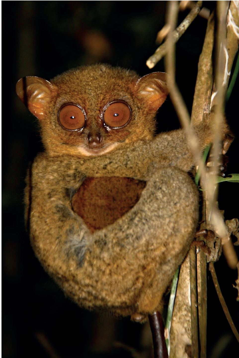
Figure 2. A tarsier infant (infant VIII) suckling.

Carried: an infant being carried by the mother and transported from one location to another ( Figure 3 ).