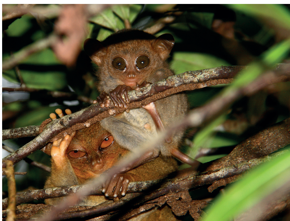
Figure 1. A tarsier infant (infant II) resting on a branch in contact with its mother.

Play : an infant was considered playing when the movement or the body posture was awkward, exaggerated or incomplete; or the speed, aiming or accuracy of the movements was relaxed (criteria consistent with the definition of play developed by Burghardt [21]). See below for more details (Video 1).