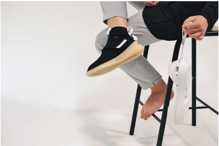
Figure 5. Putting on the weighted sole one-handed.