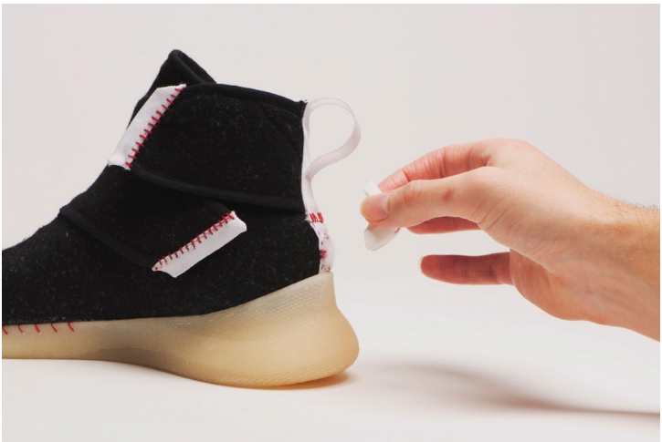
Figure 6. The iMu sensor clips into place on the back of the shoe.