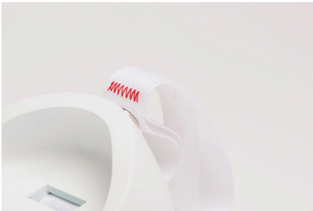
Figure 8. Detail of the clipping mechanism for the weighted sole.

The final version of 12–12 has a reduced user interface and options menu to minimize the chance of overwhelming new players. Enough options were kept allowing for variation in the game’s complexity with a failsafe to ensure the game remained playable regardless of what player changed. 12–12’s tutorial feature was enabled by default, taking users through a predetermined game that allowed them to experience the different mechanics. The tutorial requires 15 priming exercises and 30 standard repetitions to complete. Figures 9–13 show elements of the design of the game.