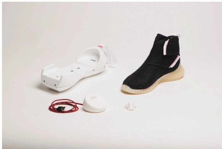
Figure 4. The physical game controller system: shoe, weighted sole, recharging dock, iMu sensors and cables.