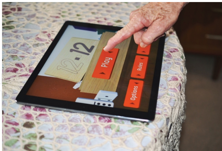
Figure 3. A participant using the game on a tablet.