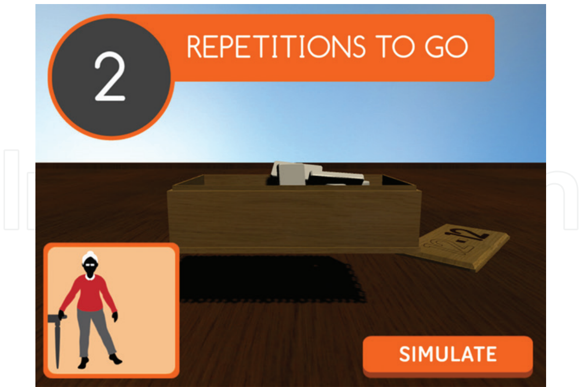
Figure 11. Initially, and to shuffle the box of dominoes, the user performs strength-based hip abduction exercises, which primes their brain for learning.