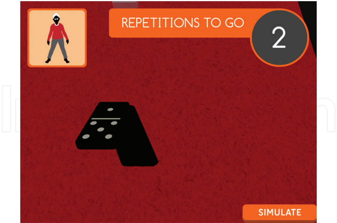
Figure 13. To move the piece of dominoes, the user needs to perform their task exercises. In this case, sideways walking makes the piece of domino roll to the player's chosen location.