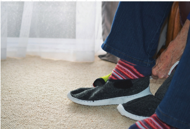
Figure 2. The design of the shoe is intended to be used with one hand, which participants could do well.