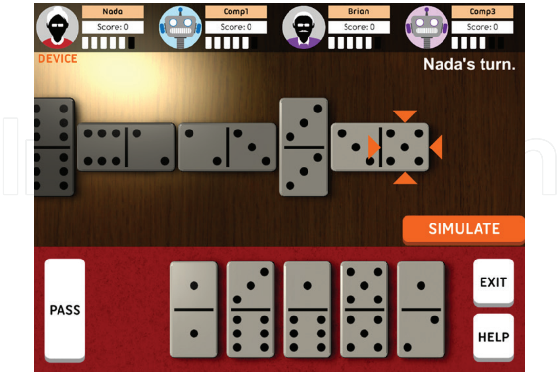
Figure 12. Tabletop of the game.