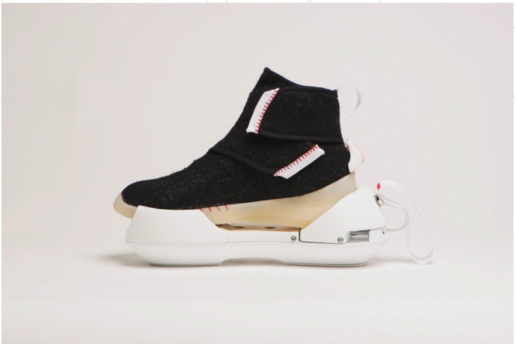
Figure 7. The shoes clipped onto the weighted sole.