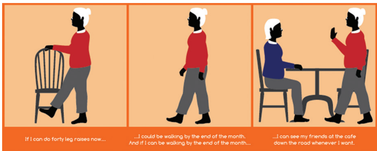
Figure 9. Progression of tasks to motivate users engage in their exercises. Left: “If I can do forty leg raises now...”; centre: “...I could be walking by the end of the month”; right: “...I can see my friends at the café down the road whenever I want”.

The final version of 12–12 has a reduced user interface and options menu to minimize the chance of overwhelming new players. Enough options were kept allowing for variation in the game’s complexity with a failsafe to ensure the game remained playable regardless of what player changed. 12–12’s tutorial feature was enabled by default, taking users through a predetermined game that allowed them to experience the different mechanics. The tutorial requires 15 priming exercises and 30 standard repetitions to complete. Figures 9–13 show elements of the design of the game.