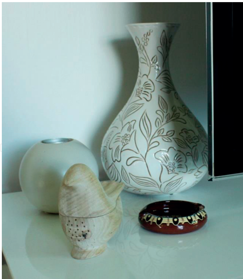
Figure 2. A chirping bird, in Household 2.

A prototype of the Peacetime concept was built and 2-week forecasts of Peacetime periods were created. Peace hours could start in the morning, in the afternoon, or multiple times throughout the day. Forecasts were accessible 3 days in advance on the Peacetime website. A switch was programmed to activate the stepping motor of the pinecone in the nest, according