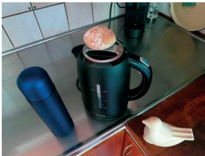
Figure 4. Household 3 used the heat of the coffeemaker to defreeze the bun instead of using the microwave.

Household 3 did not do any activities out of the ordinary “we are not going to build a sandbox” (this was one of the suggested alternatives for them as they expressed great engagement in their 1 year old granddaughter in their peace profile). Household 2 did many of the suggested alternative activities such as day dream, read that dusty book on the shelf, and cuddle. “We’ll keep the concept of Peacetime” their mother said.