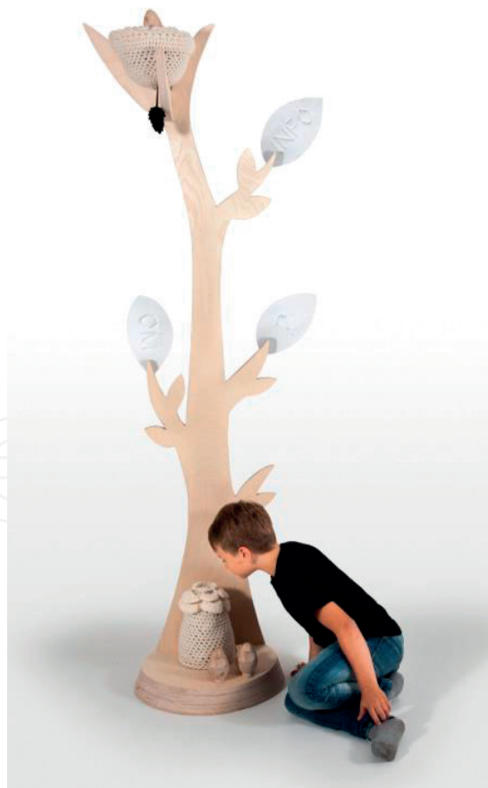
Figure 1. Staged photography of the physical prototype, consisting of a tree, with nest and pinecone, a scent-releasing flower, and three associated birds.

The Peacetime concept is composed of two parts: (i) a physical product, consisting of a tree with a nest and pinecone, a scent-releasing flower, and three associated birds, (ii) a support interface, useful to plan non-electricity consuming activities ( Figure 1 ).