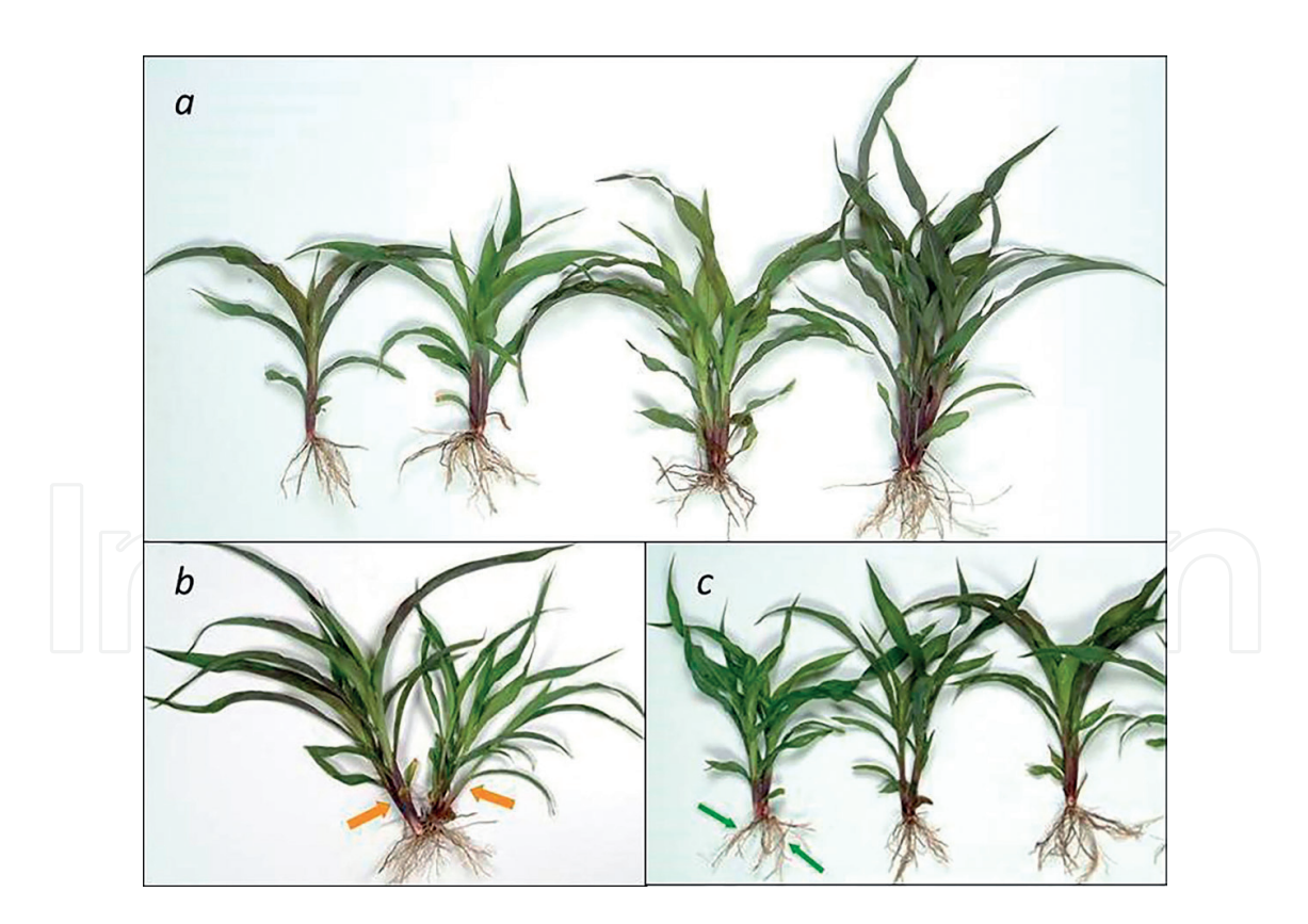
Figure 1. Polyembryonic and nonpolyembryonic maize seedlings. (a) Left to right: Normal maize phenotype, twin maize (PE maize) seedling both normal and twin of 21 days old, triple, and quadruple maize seedling of 28 days old. (b) Sixfold seedling: multiple seedling almost independent, at least sharing scutellum. (c) Several ways in which twins seedlings are observed; there are also cases of two or more radicles per PE plants.

Four years later, the percentage of PE in both populations averaged 60%; the most common issue was found in seeds with double seedlings, but the number of seedlings per seed was as high as six ( Figure 1 ). In 1996, each population (normal and brachytic plant height) was divided into two subpopulations, one with plants where PE frequency was high and one with plants where PE was low, having four different populations: the normal height plant and high polyembryony (NAP); normal height plant and low polyembryony (NBP); brachytic plant height and high polyembryony (BAP); and dwarf plant height with low polyembryony (BBP). In 1998, dwarf and normal populations reached 61 and 63% of PE, respectively [5]. The frequency of PE is currently 65 and 60% for the dwarf and normal populations, respectively;