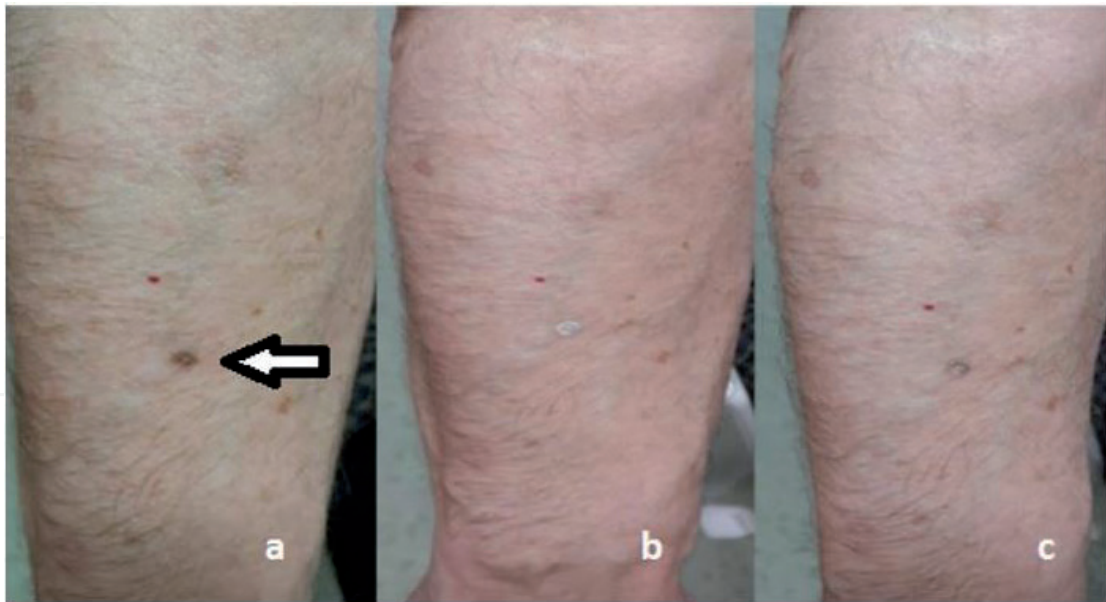
Figure 1. (a) Seborrheic keratosis in the right arm, (b) one cycle for 5–10-s freezing time via spray method, (c) before the second session of the treatment, reducing in size and fading in pigmentation of lesion.

decade (2008–2016). Additionally, it has been shown that the cryotherapy has lower cost than radiotherapy in patients who cannot undergo surgery in non-melanoma skin cancers. The average age increase in the second decade is also directly proportional to the increase in non-melanoma skin cancers [6]. For these reasons, the frequency of cryotherapy application in premalignant and malignant disorders may have been increased step by step over the years. In this chapter, premalignant and malignant cutaneous disorders have been mainly focused.