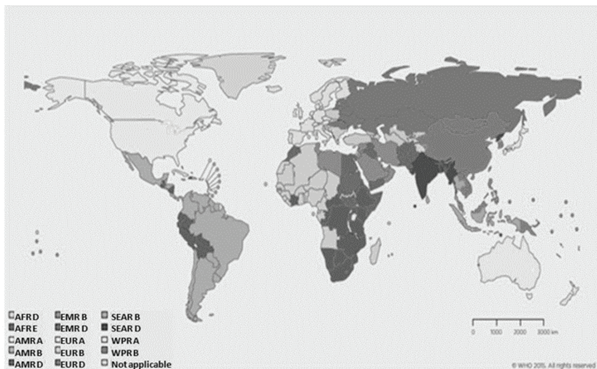
Figure 1. Geographical distribution of countries by region. Subregions are defined on the basis of infant and adult mortality. Stratum/Layer A = very low infant and adult mortality; stratum B = low infant mortality and very low adult mortality; stratum C = low infant mortality and high adult mortality; stratum D = high infant and adult mortality; and stratum E = high infant mortality and very high adult mortality. AFR: African subregion, AMR: American subregion, EMR: Eastern Mediterranean, EUR: European subregion, SEAR: South-East Asian subregions, WPR: Western Pacific subregion. Adapted from World Health Organization [26].

The risk group causing FBDs depends on the region, in developing countries such as African regions, South America, and South Asia, pathogens causing diarrheal diseases and the invasive pathogens causing infectious diseases and bacteria are the group that causes FBDs, followed by some cestodes and helminths; nevertheless, African regions, cestodes, and helminths are the group that causes FBDs because health and economic conditions limit proper food handling and preservation [17, 26].