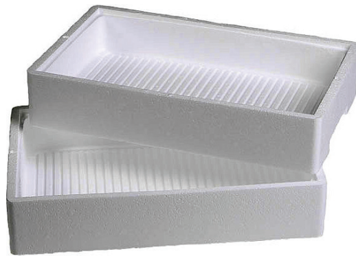
Figure 7. An example of the foam boxes suitable for the transport of crayfish on land. The corrugated bottom structure allows for maintaining moist conditions without crayfish being submerged.

Crayfish should be gently packed in specific foam boxes for the transport to the markets [23]. There should not be more than two layers of crayfish with moisture and cooling provided inside the foam box. Quite often, shallow foam boxes with less than 15 cm in height, which are routinely used in fish transport, are convenient as they can be stacked easily or can be equipped with lids ( Figure 7 ). No more than two layers of crayfish inside the box ensures that crayfish can be moving around, if needed, and the pressure from crayfish would not create circumstances which would suffocate those crayfish on the bottom. Cooling can be provided in the form of ice on the bottom of the foam boxes or cooling units [10], as long as it is ensured that crayfish would not be in direct contact with frozen solid items. It should be taken care of that the water level inside the foam box is low so that crayfish are not submerged and thus capable of gas exchange during transport. There is no need for ventilation holes in the foam box, as there is always enough oxygen in the air for crayfish and the content of metabolic gases created by gas exchange does not reach levels harmful for crayfish. The ventilation actually worsens the conditions during the transport, because it may cause elevation of the temperature due to loss of insulation and it may result in loss of moisture.