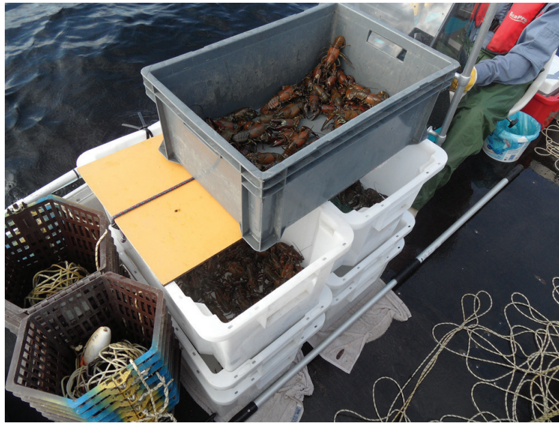
Figure 1. Sorting of crayfish catch on board according to commercial and side catch criteria. White crates with partial lids for the commercial catch and grey crate for temporary holding of the side catch.

Crayfish catch can be sorted by size, by appearance, by sex and sometimes even by species [29]. Quite often, if the catch is sorted on board, only a rough sorting to potential commercial catch and those crayfish to be released is carried out. In Sweden, specific grid systems for automatic sorting of crayfish catch by size have been utilised ( Figure 2 ). The sorting is happening after a