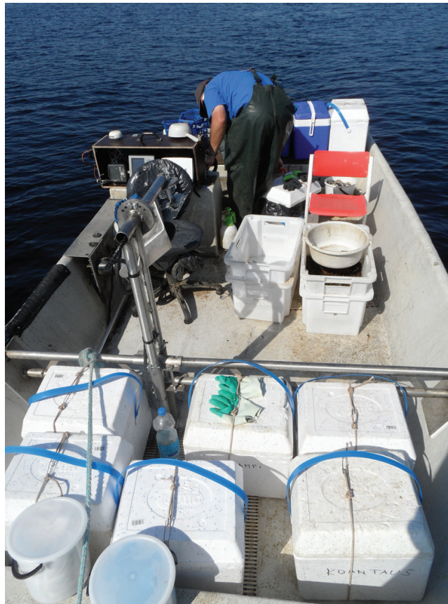
Figure 3. Crayfish transported on board in foam boxes with cooling and moisture provided.

Crayfish tend to go passive with lowering of the temperature. It is preferential to provide stable conditions during transport, and for this purpose, a simple environment within cooled foam container, i.e., esky or foam box for fish, has shown to be optimal [10, 23] and is commonly used both in Sweden and Finland ( Figure 3 ). The instant cooling of crayfish under conditions, which also provide immobilisation and moisture, has shown to decrease stress [16, 28] and minimise mortalities even during prolonged transport.