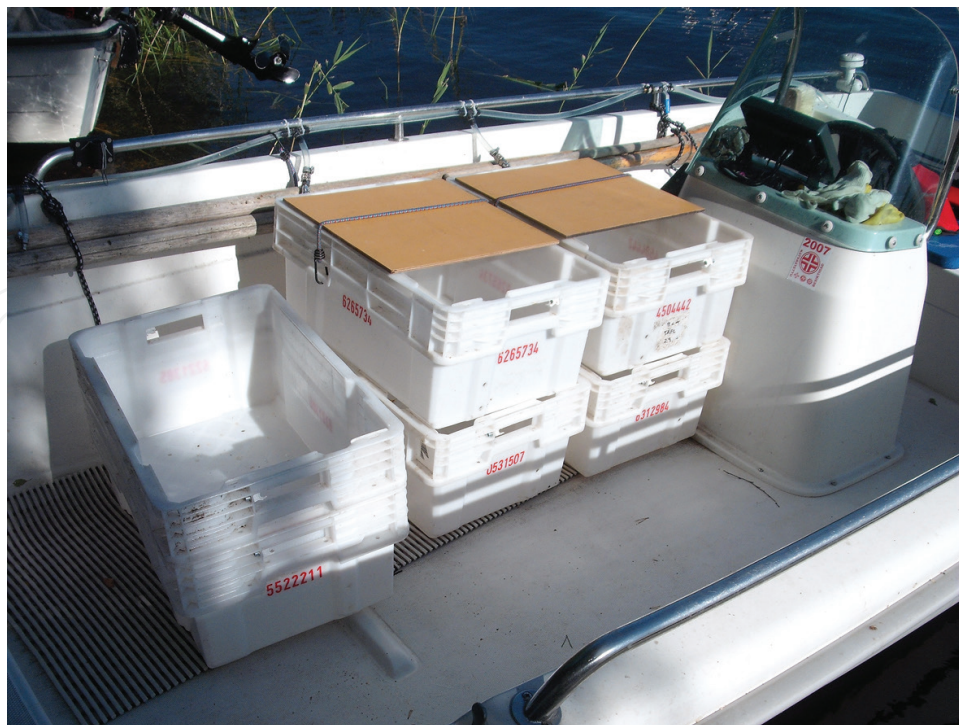
Figure 5. CrayShower on board transport application. This system uses lake surface water, thus not suitable during warmest summer days.