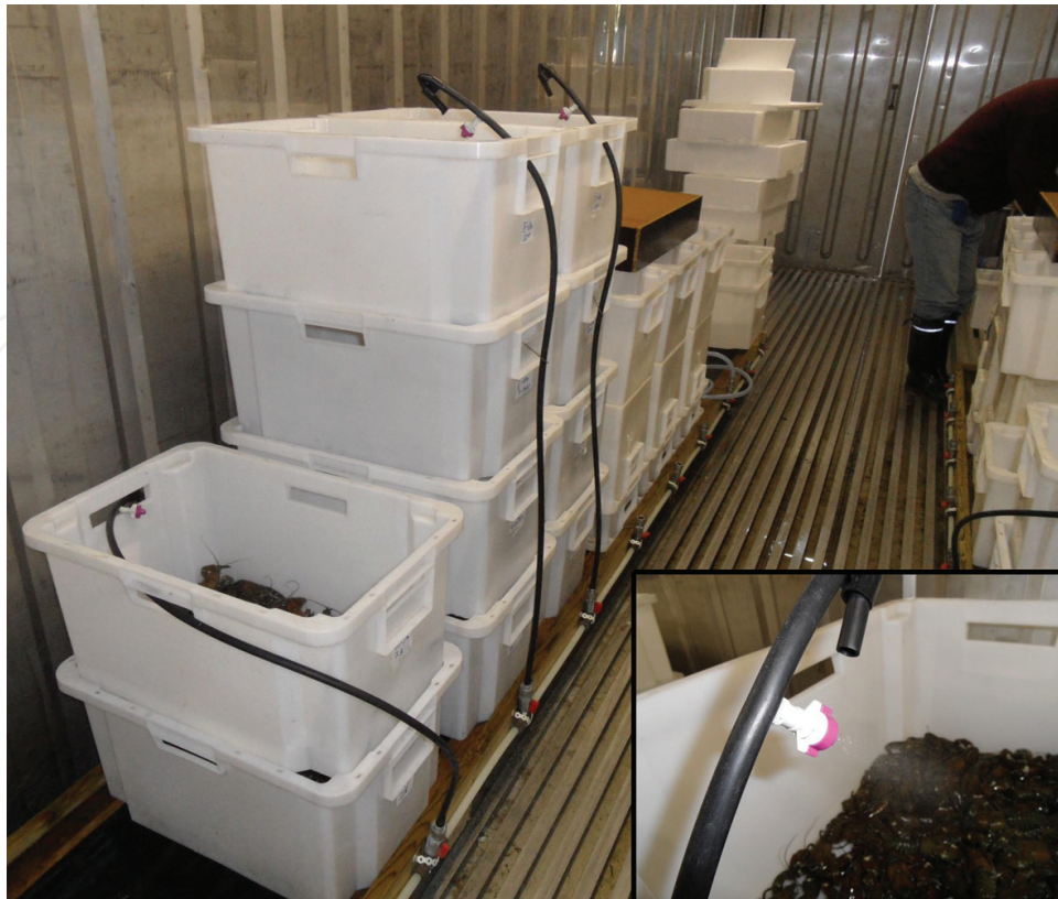
Figure 6. CrayShower with stacked plastic containers for holding of crayfish and a close-up of the water sprinkler system (small picture).

Crayfish can be held under these conditions for several months without significant losses in the number or quality of crayfish. Tasting tests indicated that crayfish held for 9 months in the CrayShower were of equal quality (test and texture of flesh) compared to those been held in tanks and given food for the same period. The survival among the CrayShower-held crayfish was significantly higher and stable throughout the holding period than tank-held crayfish. Thus, the CrayShower system, being slightly more expensive to build, would be more economical to utilise than the conventional holding in tanks. The benefits of the CrayShower would be less water utilised, higher survival of crayfish and decrease in workload.