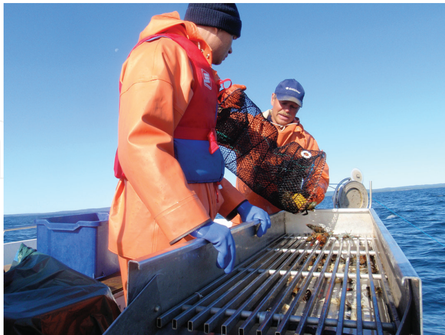
Figure 2. Sorting of crayfish catch on board by size. A system of a grid with expanding distances of metal bars allows crayfish to be sorted by size as they slide on the grids.

Crayfish catch can be sorted by size, by appearance, by sex and sometimes even by species [29]. Quite often, if the catch is sorted on board, only a rough sorting to potential commercial catch and those crayfish to be released is carried out. In Sweden, specific grid systems for automatic sorting of crayfish catch by size have been utilised ( Figure 2 ). The sorting is happening after a