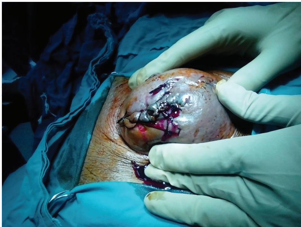
Figure 1. A badly skin stitched leaked hernia reflect the unaccepted surgeon attitude against those cases.

Hernia repair in these patients remains a procedure with a high morbidity and mortality rate if it is performed in emergency conditions due to the occurrence of complications [23].