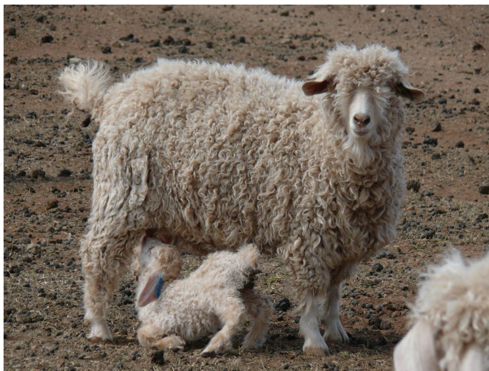
Figure 1. A typical South African Angora doe and kid (University of Pretoria).