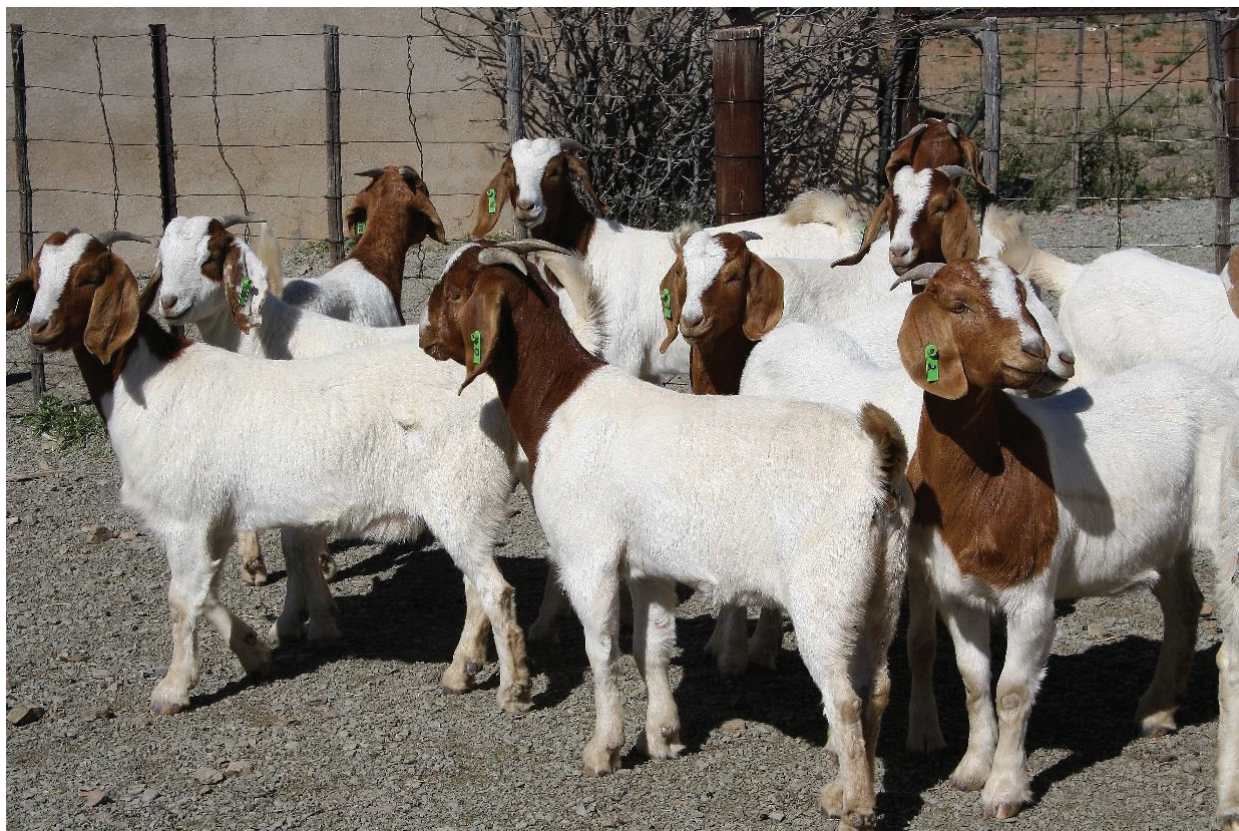
Figure 2. Typical South African Boer goats with white body and red head and neck (University of Pretoria).