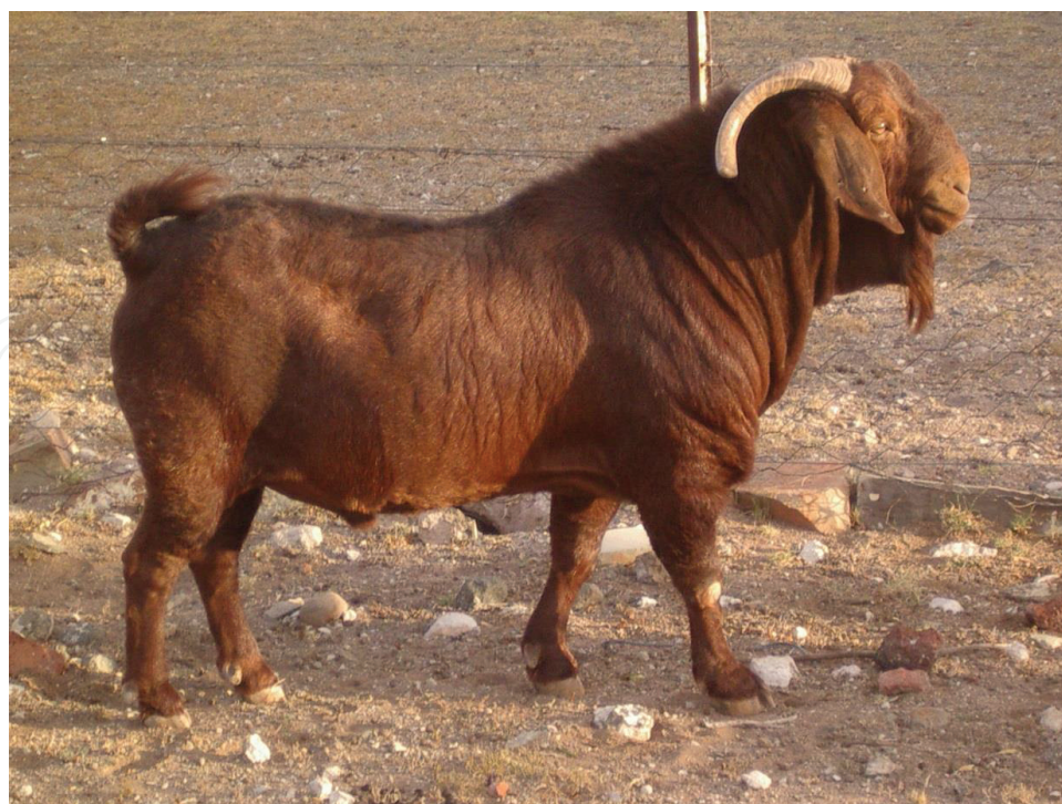
Figure 3. A Kalahari Red goat with the characteristic uniform red coat color (University of Pretoria).