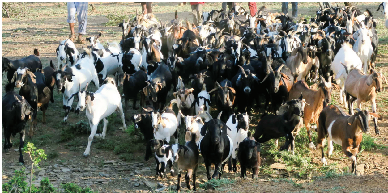
Figure 5. A herd of South African unimproved veld goats.

are often promoted as having special adaptive characteristics, including a higher tolerance for tick-borne diseases compared to the commercial goat breeds [8, 10]. In Figure 5 , a typical South African veld goat is shown.