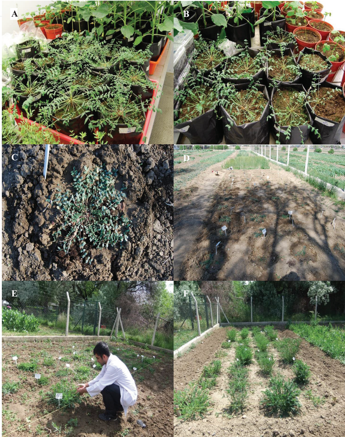
Figure 3. General view of survived plants of sainfoin in growth chamber (A and B). Transferred putative mutants against to salt stress in the field (C and D). Putative mutant sainfoin plants in the field after 1.5 months (E) and 2 months (F) (Location: The University of Ankara, Faculty of Agriculture, Department of Field Crops, Turkey, photos were taken on 21 March 2013).

development ( Figure 2E and G ). Superior plants (putative mutants) in terms of salt tolerance were moved to a growth chamber ( Figure 3A and B ) for a while, and after that, they were transplanted in field ( Figure 3C–F ).