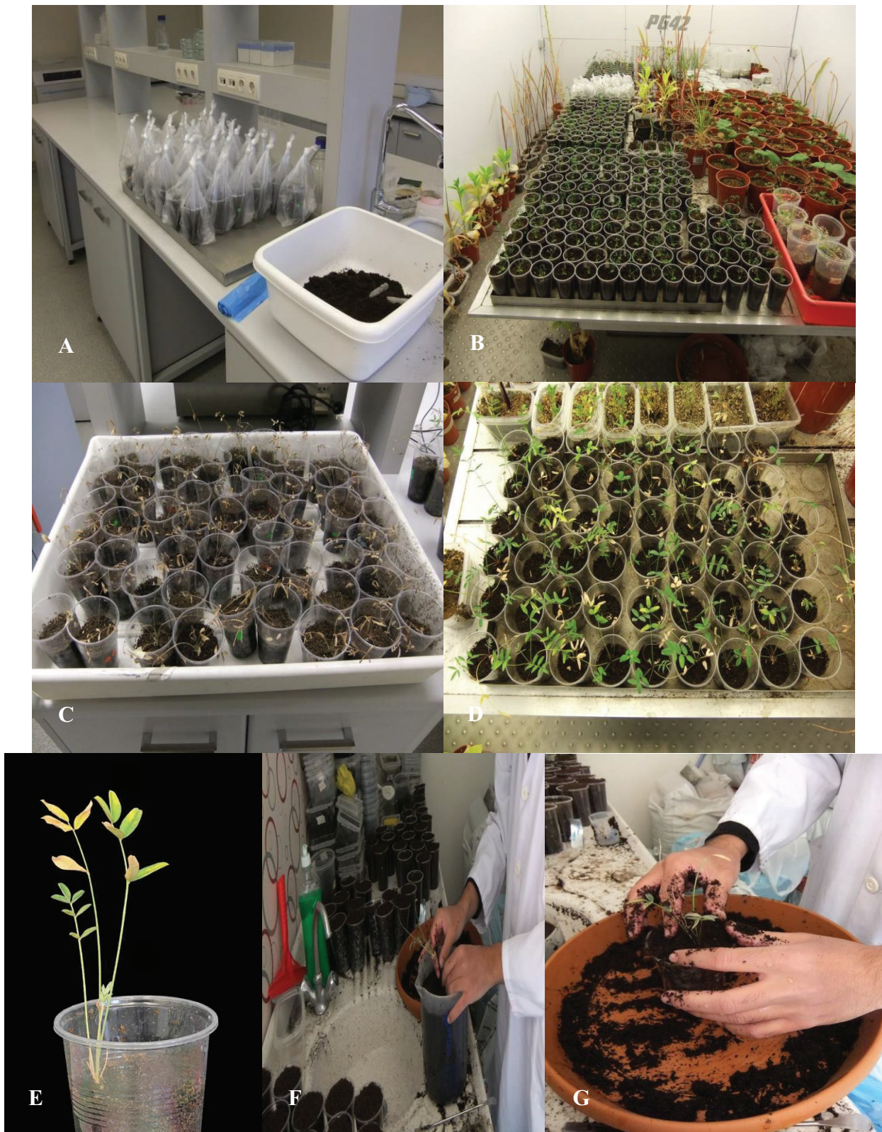
Figure 2. General view of plantlets in freezer bags (A). Plantlets which removed freezer bags in plant growth chamber (B). Dead plants as a result of salt application (C). Survived plantlets (D). Survived plantlets after treatments of NaCl (E). Washing root of survived plants with tap water to get rid of NaCl and transferred to new soil without NaCl (F and G).