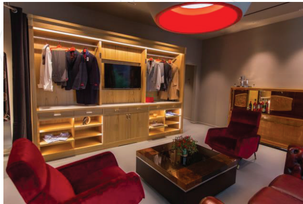
Figure 4. The Vesuvio room, reserved for premium clients.

In the flagship stores, the displays of the clothing are well separated from each other and the lighting is natural because the handcrafted items need wide spaces and natural lights in order for customers to observe the details accurately. Finally, an important role is played by the windows, which are designed both to have a communication function and to be a link between the indoor and the outdoor ( Figure 4 ).