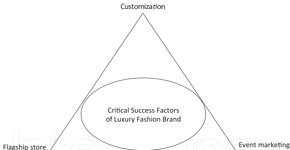
Figure 1. The conceptual framework.

In line with the theoretical assumptions outlined in the previous section, this study uses an original conceptual framework (see Figure 1 ) to analyze a firm's critical successful factors. In order to build strong consumer-brand relationships, we have identified three critical success factors for a luxury brand: customization, event marketing and the flagship store. This approach considers consumers as rational and emotional individuals who are affected cognitively and emotionally by their consumption experience.