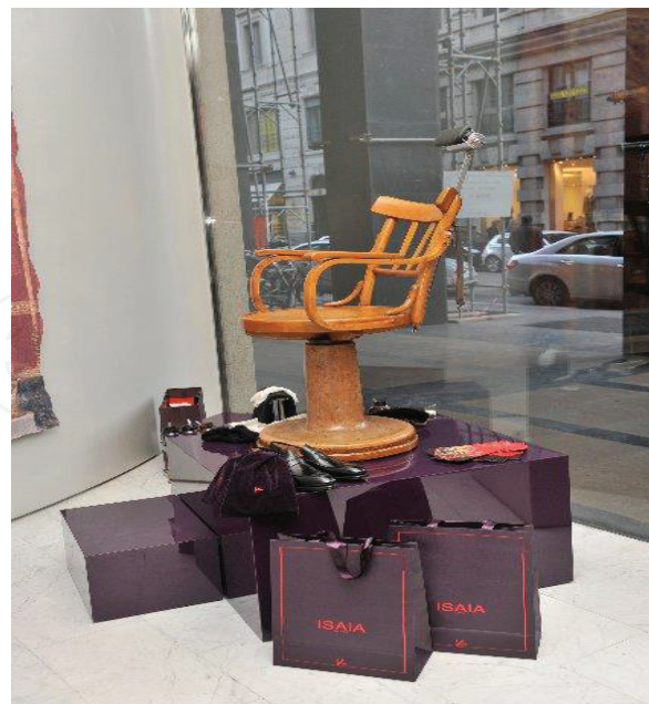
Figure 3. The shoeshine chair during the Sciuscìa event.

It is possible to note the strategic role played by the store, as event space, to support communication between Isaia and its stakeholders. A successful example was the “ Sciuscìa event,” in 2010, when a professional shoeshiner offered a unique and memorable experience to Isaia customers, in enacting a historical Neapolitan tradition ( Figure 3 ).