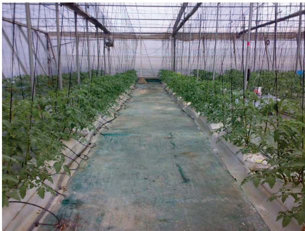
Figure 3. Different types of a greenhouses flooring.