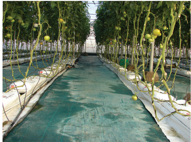
(b) Hydroponic crop greenhouse with mulching