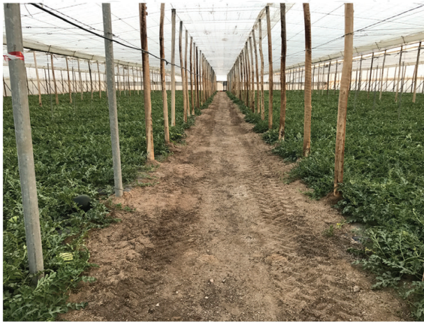
(a) Soil cropping greenhouse

so that the robot can determine the way to follow centering itself between plants. Figure 3 shows two different types of flooring, a soil cropping greenhouse and an hydroponic crop greenhouse with mulching. For both cases different umbralization values must be chosen in a manual way, so if the incorrect value is chosen by the farmer, the greenhouse corridors will not be correctly identified, and the Fitorobot will collide with the plants causing a disaster with important economic consequences. Figure 4 shows an example of segmented corridor.