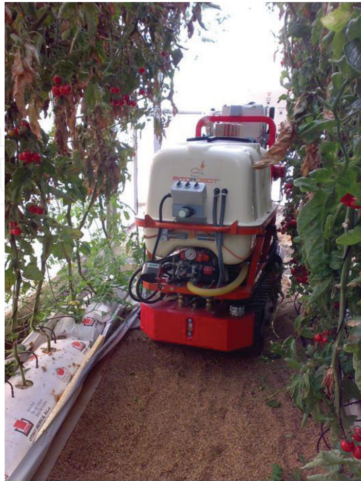
Figure 1. Fitorobot [1].

between the track centers is 0.5 m. More details about the features of this TMR can be found in Ref. [1].