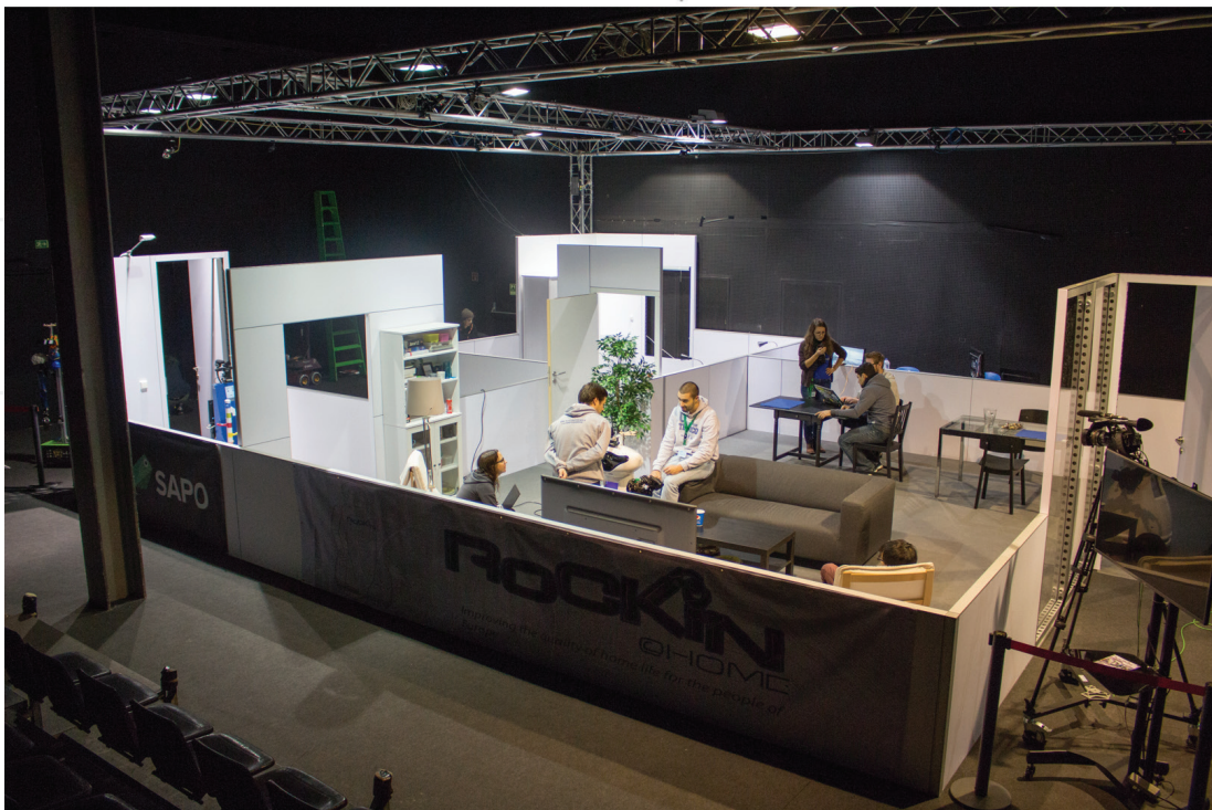
Figure 2. RoCKIn@Home test bed, including the trusses for the MCS cameras on the right.