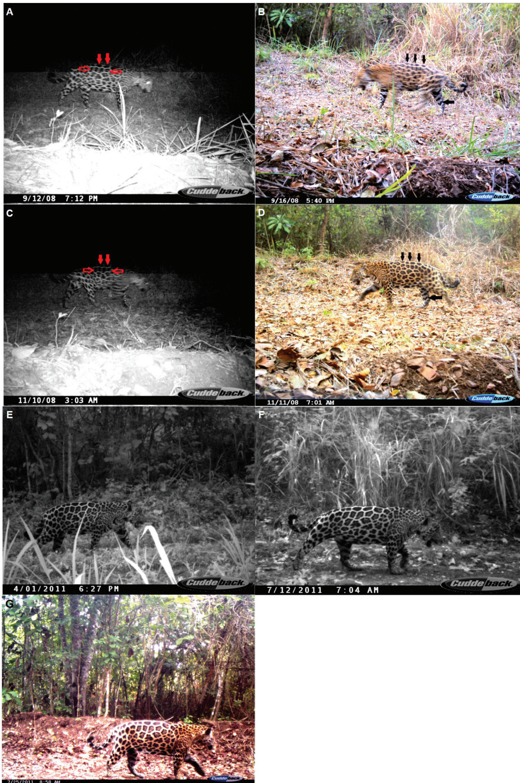
Figure 3. Camera trap photos of a jaguar mark-captured and recaptured in the study area from 2008 to 2011. The same individual was observed in the following dates in two different sites: (A) 9 September 2008; (B) 16 September 2008; (C) 10 November 2011; (D) 11 November 2011; (E) 01 April 2011; (F) 12 July 2011; and, (G) 25 July 2011. The red and black arrows in photos A-D indicate number and shape of black spots to identify the jaguar. Photos of jaguar captured from 9 September 2008 to 11 November 2008 were adapted from Ref. [16].