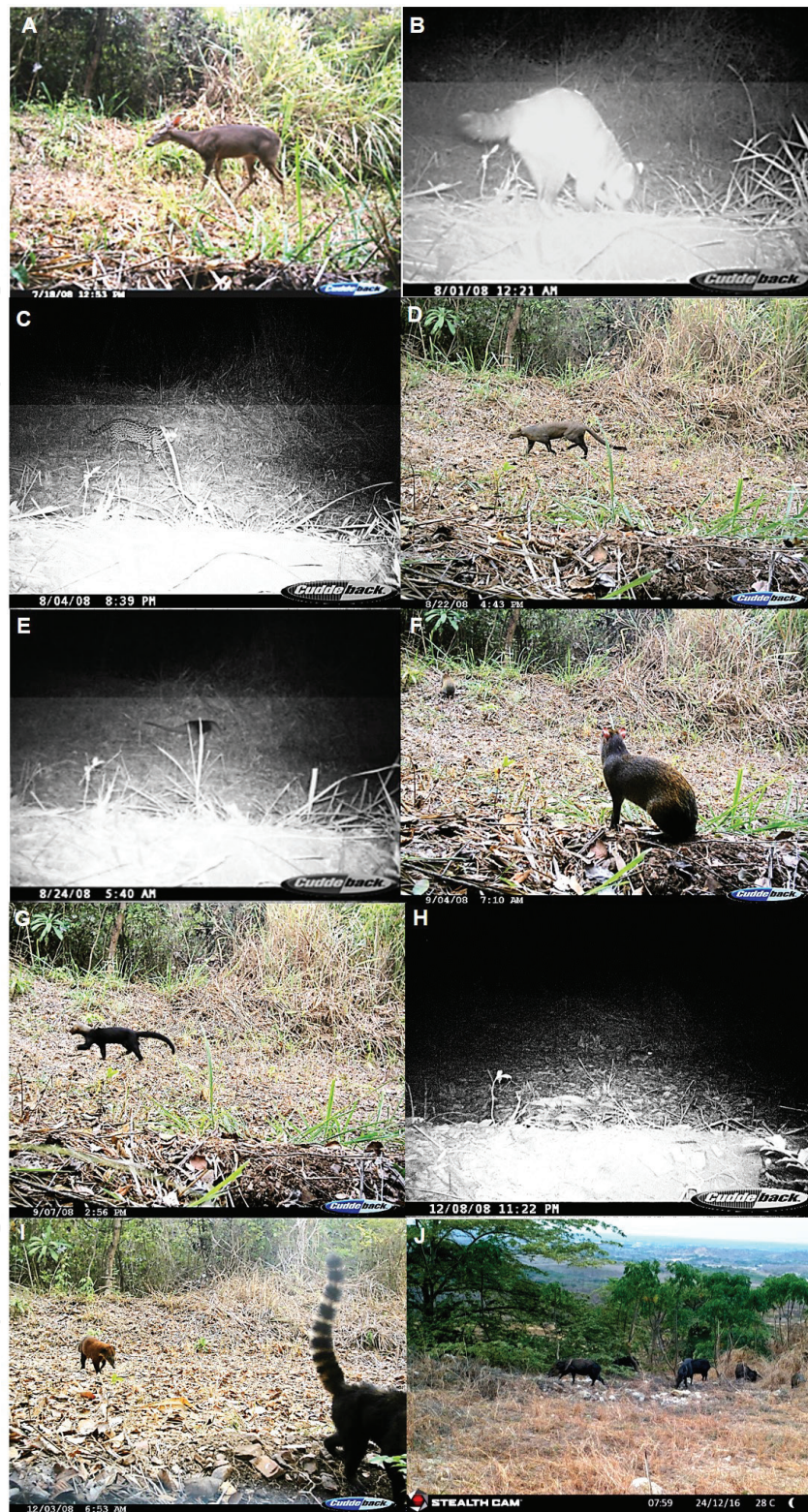
Figure 4. Camera trap photos of tropical mammals recorded in the study area from June 2008 to February 2009. (A) White-tailed deer ( O. peruanus ); (B) crab-eating raccoon ( P. cancrivorus ); (C) ocelot ( L. pardalis ); (D) jaguarondi ( P. yagouaroundi ); (E) Northern tamandua ( T. mexicana ); (F) Central America agouti ( D. punctata ); (G) Tayra ( E. barbara ); (H) forest rabbit/tapeti ( S. brasiliensis ); and, (I) white-nosed coati ( N. narica ). Additional deployment of a camera trap in 2016 confirmed the presence of collared peccaries ( P. tajacu ) in BPCB (J). The photo set containing Figures A-I were adapted from Ref. [16].