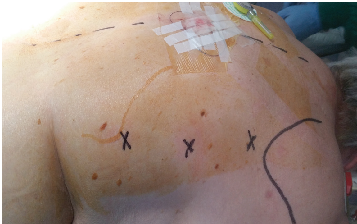
Figure 1. Thoracic trocar position on the right chest for thoracoscopic esophagectomy.

Pneumothorax is created and the insufflation pressure must be maintained at 6–8 mmHg. A single retracting suture in the diaphragm could be used to provide downward traction allowing good exposure of the distal esophagus, although in most occasions this is not necessary.