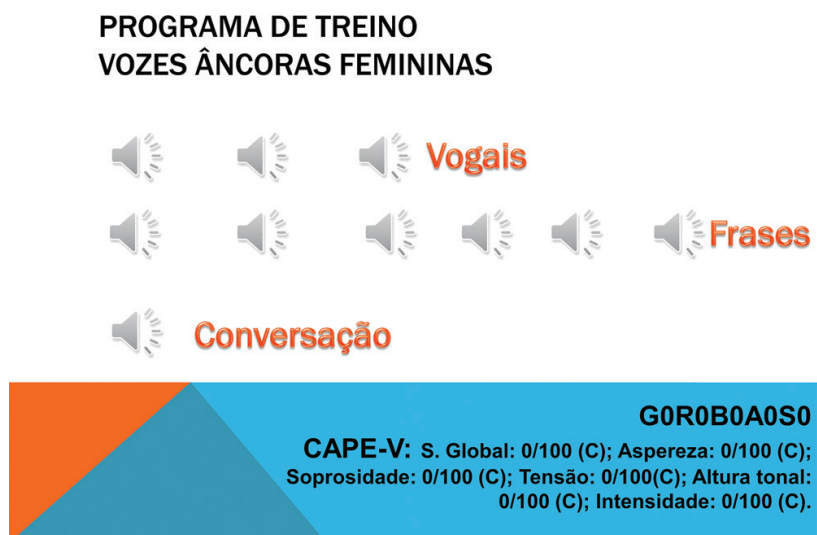
Figure 3. Screenshot from the PowerPoint presentation used to run the training programme. Samples (anchors) of female voices with GRBAS and CAPE-V classifications are shown.