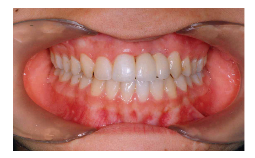
Figure 2. A patient immediately after implant insertion.

Figure 1. A patient immediately after implant abutment insertion.