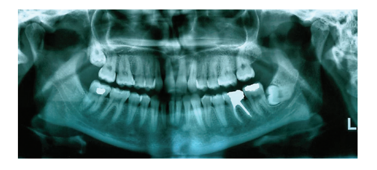
Figure 10. OPG of the same patient 5 years after orthodonticspace closure.