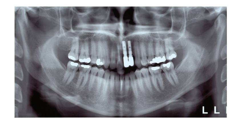
Figure 5. OPG of the same patient after 5 years.