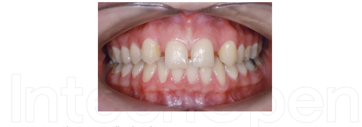
Figure 7. A patient with missing maxillary lateral incisors.