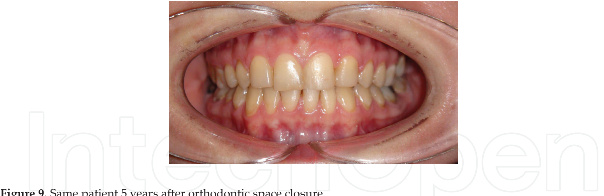
Figure 9. Same patient 5 years after orthodontic space closure.

Figure 8. OPG of the patient with missing maxillary incisors.