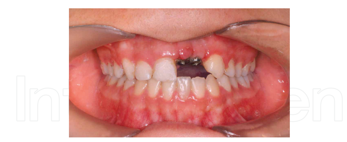
Figure 1. A patient immediately after implant abutment insertion.