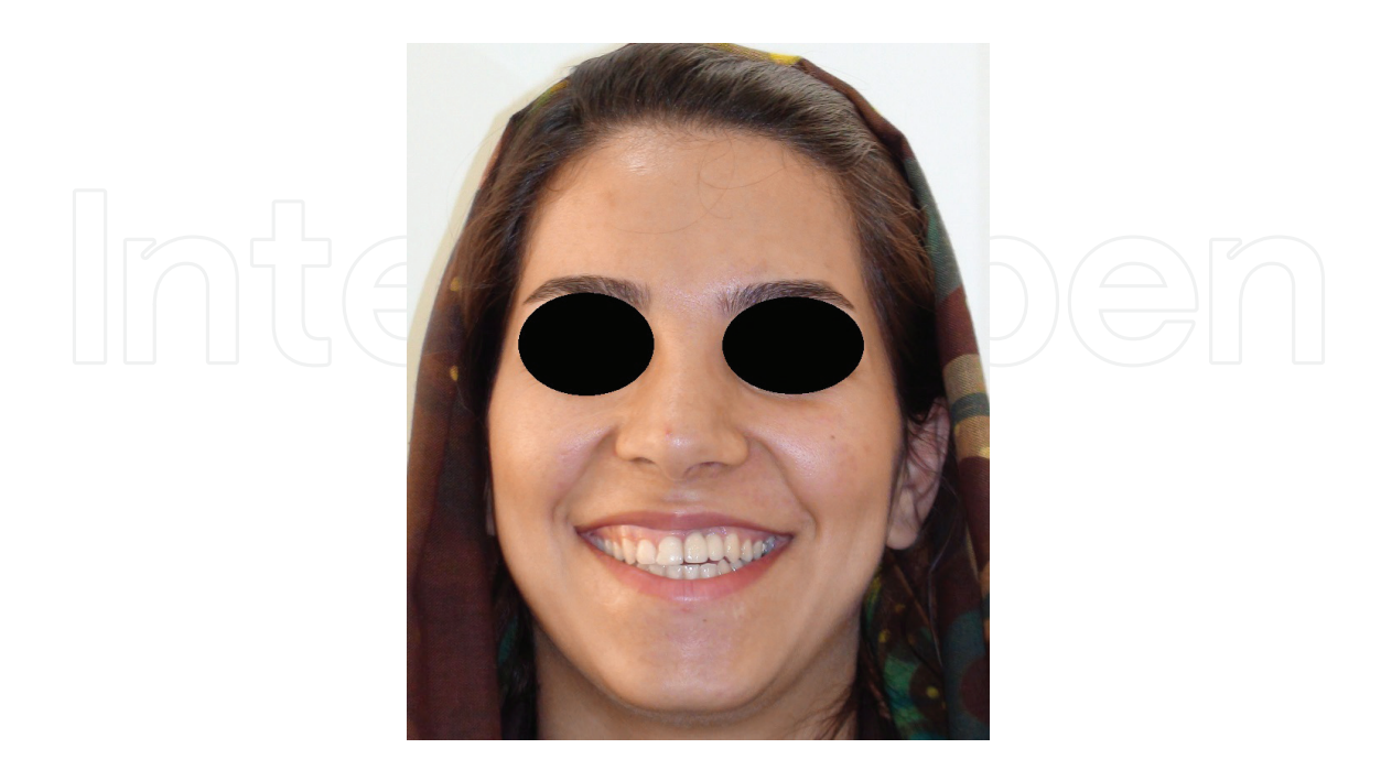
Figure 6. Frontal view of the patient after 5 years.