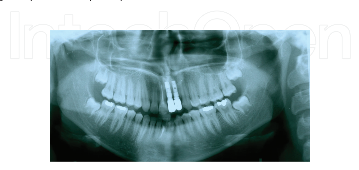
Figure 3. OPG (Orthopantomogram) of the same patient.