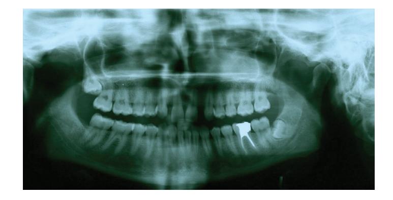
Figure 8. OPG of the patient with missing maxillary incisors.