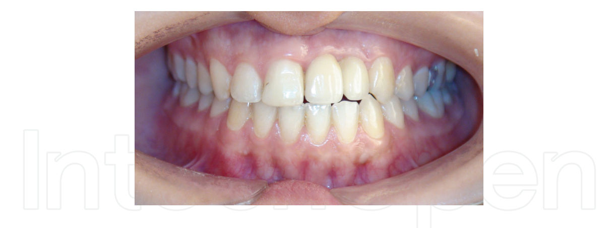
Figure 4. Same patient after 5 years.