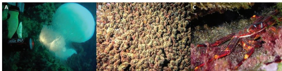
Figure 3. (A) Rhopilema nomadica, (B) Brachidontes pharaonis, (C) Percnon gibbesi.

Ecology: Suspension feeders. Lives in shallow water (at sea level or just below) attached by