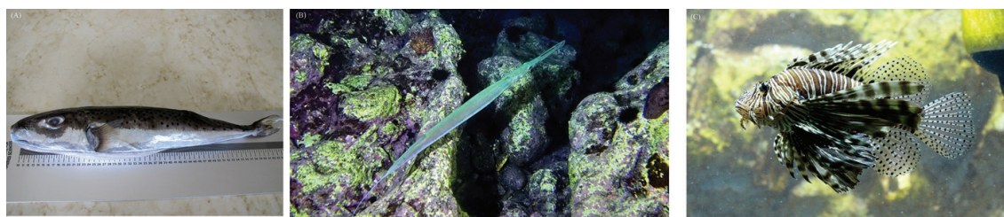
Figure 4. (A) Lagocephalus sceleratus, (B) Fistularia commersonii, (C) Pterois volitans.

Description: The body is elongated (20–85 cm), somewhat compressed laterally and inflatable. The body is brownish in colour with black, regularly distributed spots of equal size dorsally; a conspicuous wide silver band is present on the lower parts of the flanks, from the mouth to the caudal fin. The head is large with a blunt snout.