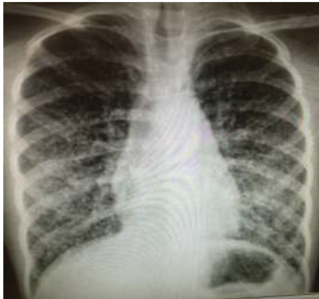
Figure 4. Micronodules in both lungs. Aspect of miliary TB. In fact, it was a thyroid carcinoma with metastases.

Some of these radiological findings in suspected cases of TB in children always require some differential diagnoses. Thus, the miliary pattern may appear on acute histoplasmosis or lung metastases of neoplasm ( Figure 4 ); the unilateral or bilateral adenomegalies may arise in the course of Hodgkin's disease or sarcoidosis, and slow progression of pneumonia may also occur in atypical pneumonia (for Mycoplasma , for example), pneumonia caused by common germs, actinomycosis, nocardiosis, and other noninfectious agents in immunocompromised patients. In adolescents, radiological aspects are identical to the pattern seen in adults: adult-type TB ( Figure 5 ).