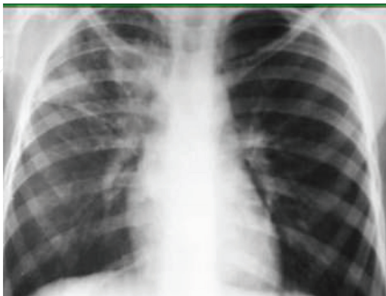
Figure 5. Pulmonary infiltrate in upper zone of the right lung. Aspect of TB adult type .