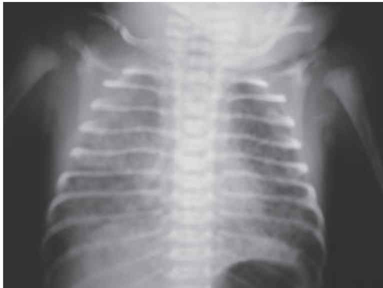
Figure 2. Micronodules in both lungs; miliary TB.

aspect—diffuse micronodular pattern in both hemithoraces, corresponding to hematogenous spread of TB ( Figure 2 ) and appearance of alveolar pneumonia, that is, pattern of bacterial pneumonia caused by common germs, like pneumococcus, which may only be a case of TB when it becomes a case of slow evolution, not responsive to antibiotics ( Figure 3 ) [4, 10]. It is often emphasized that many times we observe clinical and radiological dissociation in TB in children. The clinical evaluation of the child is disproportionately favorable in relation to the extent of radiation injury. That is, the radiological image suggests a serious pneumonia but the patient does not show signs of severity that would be expected in a pneumonia caused by common germs.