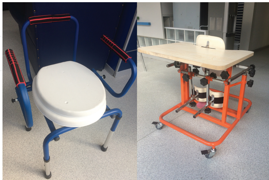
Picture 1. Assistive technology for daily living activities.

A person can have different roles simultaneously, and the roles we hold during our lifetime can change such as being a student, parents, a son, a sibling, an employee, a friend, and a