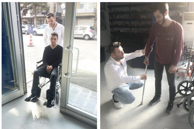
Picture 3. Client's needs for mobility.