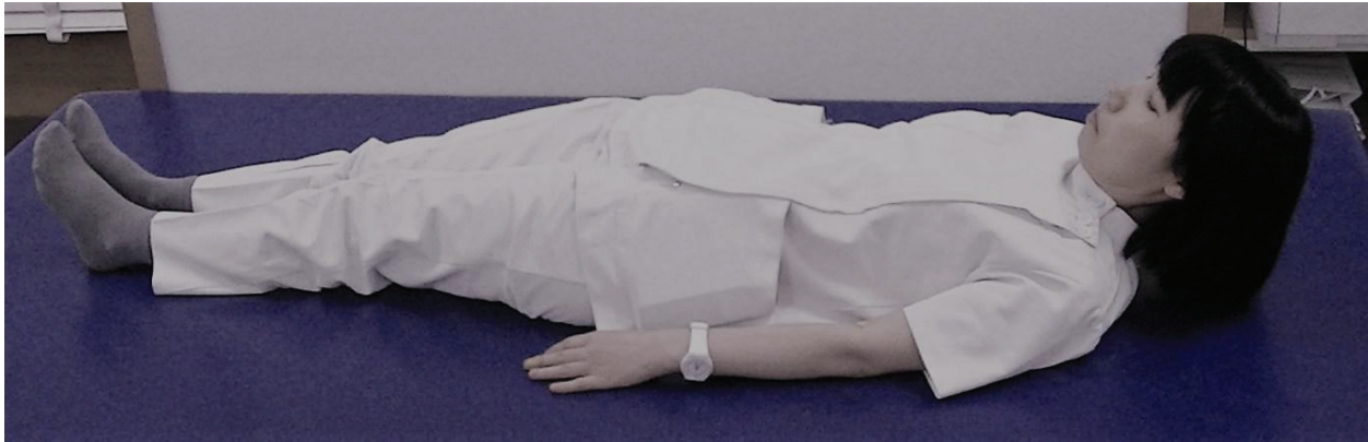
Figure 3. Shaker exercise. Lying on a bed and raising the head without lifting the shoulder, while looking at the toes.