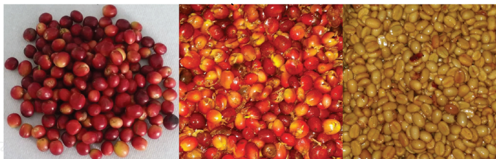
Figure 3. Coffee cherry: exocarp, mesocarp bound endocarp.