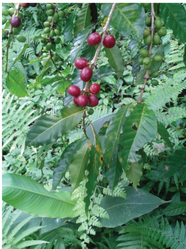
Figure 1. Coffee cherry fruit.