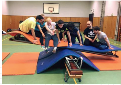
Figure 2. The seesaw: a group activity in psychomotor therapy.

goal. Other group members intrude into their comfort zone, and the patients are confronted with body contact. For some patients, this is a stress situation. How can they cope with this stress?