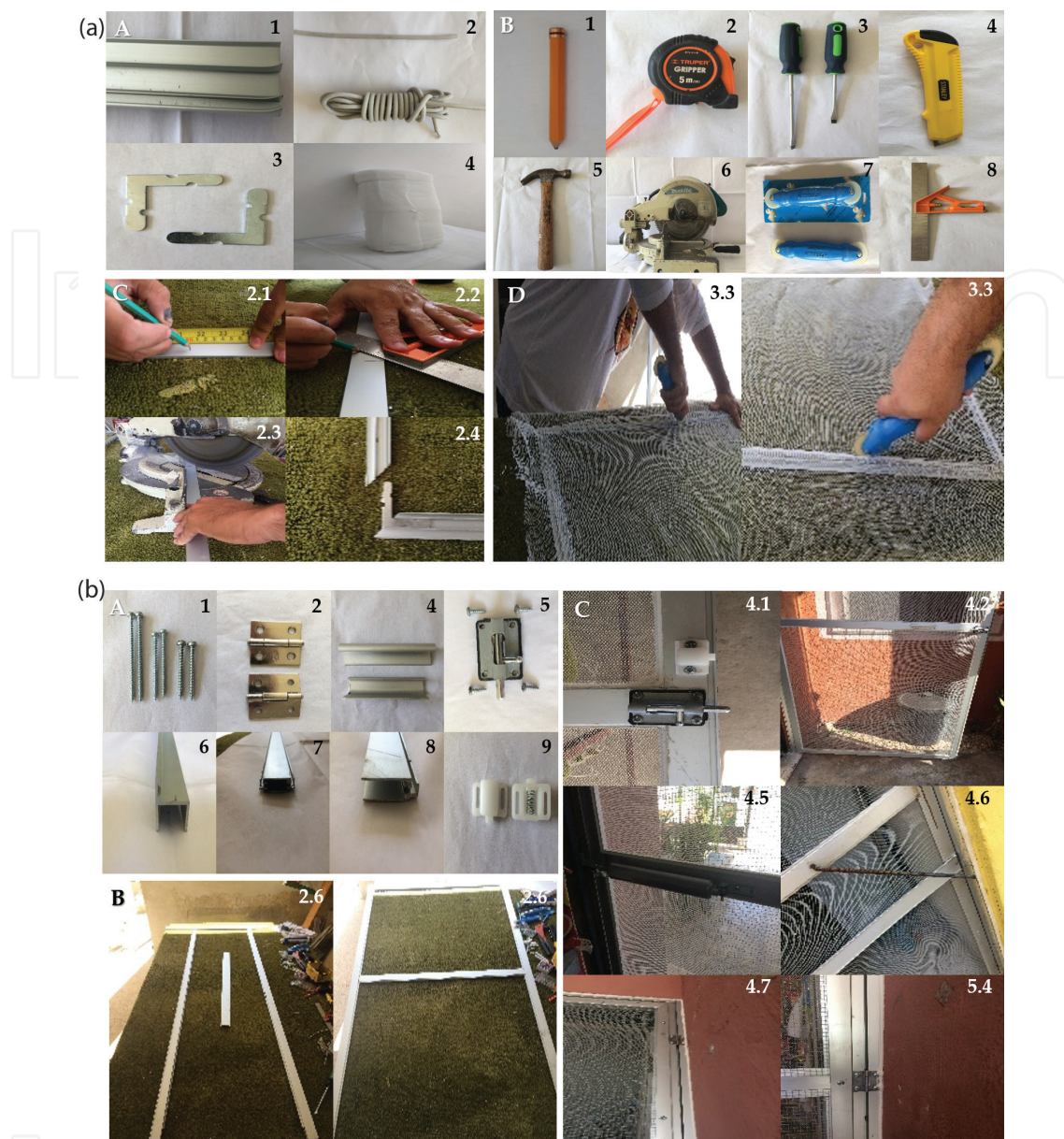
Figure 2. General description of how to install insecticide-treated screens on windows and doors. Window: (A) Materials required: (1) screen frame, (2) square for screen frame, (3) vinyl #12 and (4) window screen. (B) Tools required: (1) pencil, (2) measuring tape, (3) screwdriver, (4) sharp knife, (5) hammer, (6) hacksaw, (7) convex wheel and (8) universal square. (C) Step 2: (2.1) Using a measuring tape and pencil, make a mark where a cut is to be made on the new frame. (2.2) With the universal square, mark a 45° angle on the first mark of the final measure. (2.3) Use the hacksaw to make the 45° cut. Make four cuts, one on each side of the window. (2.4) Use squares to join the four parts of the frame. Insert squares into the frame along the side with 45° cut and lightly tap the squares into place. Check the assembled frame for squareness. (D) Step 3: (3.3) With the help of the convex wheel, insert the screen into the channel with vinyl, beginning at one corner (press down and roll with short strokes back and forth). When all sides have been inserted into the vinyl, remove the excess vinyl. Door: (A) Materials required: (1) screws (1 ½ × 8", ½ × 8, 1 × 8), (2) hinges, (3) vinyl # 12, (4) elephant trunk handle, (5) hasp, (6) chair butt, (7) mosquito door frame central, (8) mosquito door frame vertical and (9) lock. (B) Step 2: (2.6) Forming the door, 1 ½ × 8 screws should preferably be used. Step 4: (4.1) The lock and pin are installed in the central part of the frame, at the appropriate distance for its correct operation. (4.2) The elephant trunk handle is installed in the central part of the frame. (4.5) Spring allows the automatic closing of the door. (4.6) Pivot allows the automatic closing of the door in a slow and controlled way. (4.7) Metal mesh protects the mosquito net from damage caused by animals. Step 5: (5.4) Fix the door to the frame using ½ × 8 screws, a drill and a screwdriver. Check the assembled door for squareness.