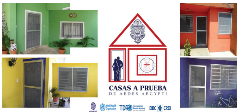
Figure 1. Photographs show Aedes aegypti -proof houses with insecticide-treated screens mounted on aluminium frames and fixed to external doors and windows of treated houses.

The intervention called Aedes aegypti -proof houses ('Casas a prueba de Aedes aegypti ') involves insecticide-treated screening (ITS) with the use of long-lasting insecticidal nets (LLINs) permanently fitted to windows and doors to exclude A. aegypti , vector of dengue, chikungunya and Zika (Figure 1).