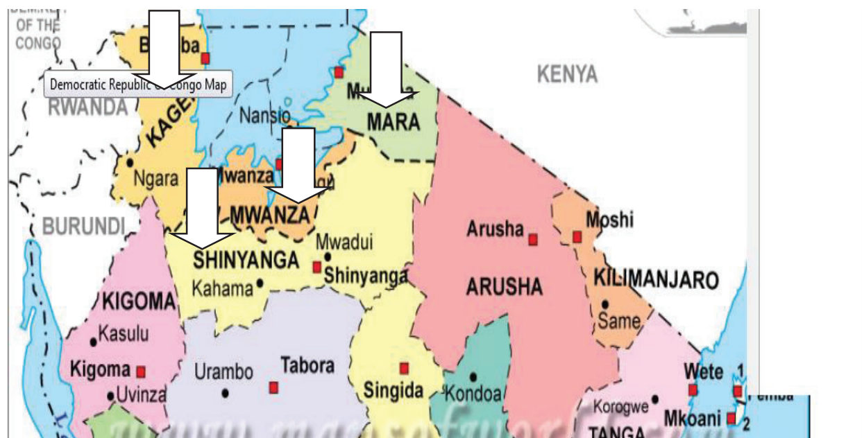
Figure 1. A map of the southern region of Tanzania showing the study areas.

The Marando Bora project expanded to cover four regions of Tanzania. An estimated 110,000 households were reached through the project between 1999 and 2012. The regions the project has covered are Mara, Mwanza, Shinyanga, and Kagera ( Figure 1 ). These regions fall the drier