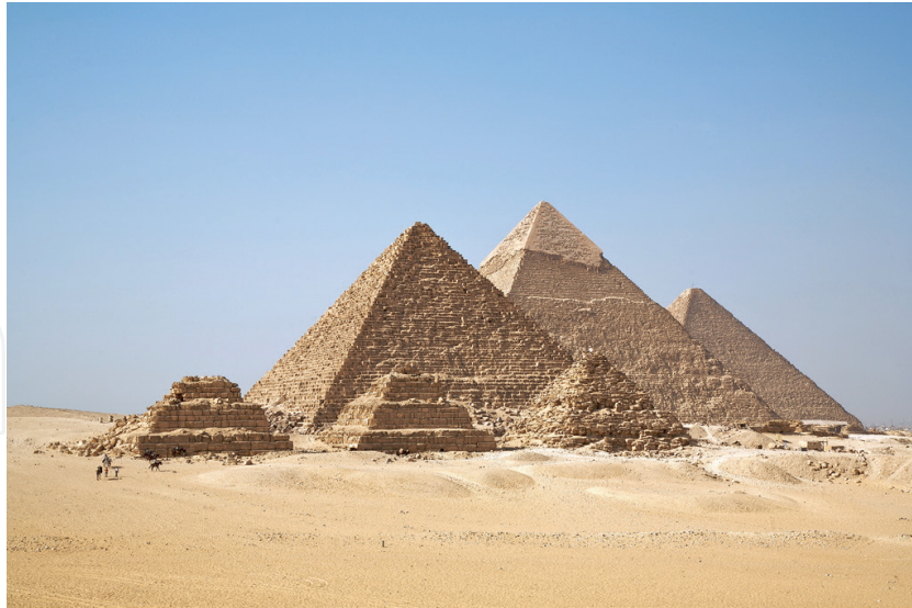
Figure 1. Solutions for parasitic problems as old as the Egyptian pyramids.

malaria. Before we proceed, it is worth to mention that many of the pharaoh's written orders that urged farmers to combat pests and protect the environment from pollution. Consequently, Egypt was one of the first countries that paid special attention to environmental problems and its impact on the individual who is considered the most important wealth. The Egyptians did not like pests which plagued them but accepted them as a legitimate part of creation;