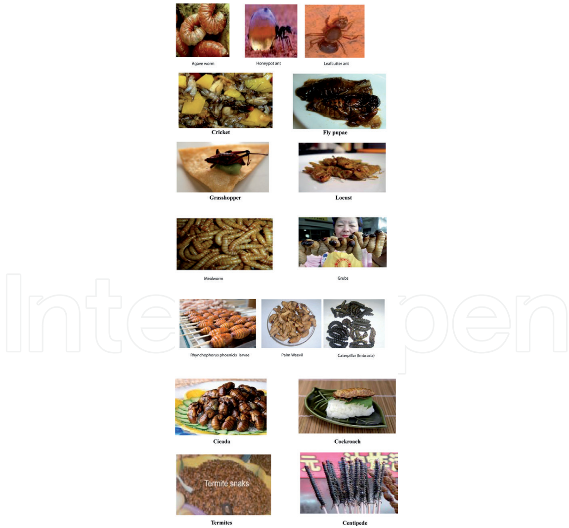
Figure 3. Examples of edible insects.