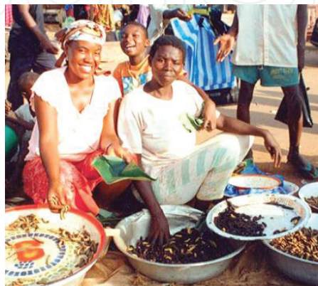
Figure 4. A picture showing women and children selling edible insects in local markets.

Considering the popularity of edible insects, it is not surprising that scores of species have been and are prominent items of commerce in the town and village markets of Africa and tropical and semitropical regions of the world [24]. In several areas in Africa, particularly in Zimbabwe, Nigeria, South Africa, Ivory Coast, and Zambia, many families make fairly good living from selling insects [25, 26]. These insects are mostly gathered from bushes and farmland by women and children (Figure 4), processed, and eaten or sold in school premises and