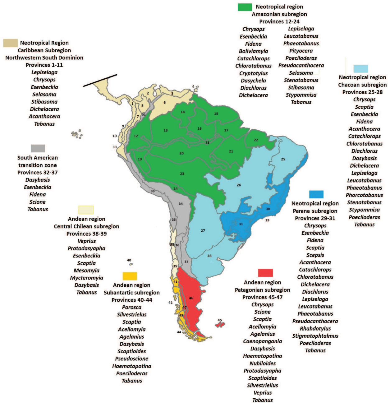
Figure 2. Distribution of genera of tabanids according to occurrence of species in regions and subregions of South America. Neotropical Region: Caribbean, Amazonian, Chacoan and Parana subregions; South American Transition Zone; Andean Region: Central Chilean, Subantarctic and Patagonian subregions. Adapted with permission of Morrone [43, 44].

America especially in Chile and Argentina, only the primitive species can be found. Other primitive species occur in eastern Nearctic region, temperate South Africa, Northeast Asia and Japan, and eastern and southeastern Australia. The more specialized representatives occur in the Old World tropical and southern Africa, Madagascar, Seychelles, Indonesia, New Guinea, and Australia with few species in India and Southern China. The South-American species of Bouvieromyiini tribe are species that occur in the temperate regions of central Chile and Southeast Argentina (Chacoan subregion), and belong to the single subgenus of tribe.