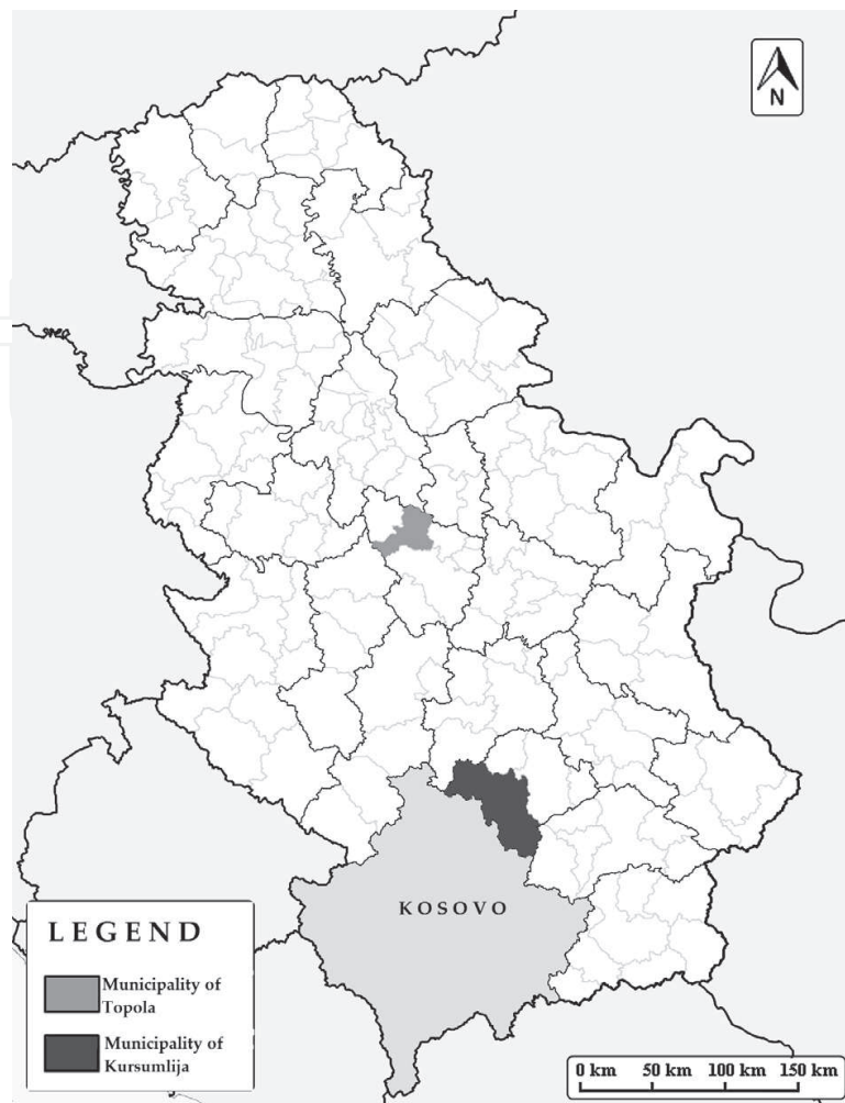
Figure 1. Location of the municipalities of Kursumlija and Topola (Serbia).

Data obtained using NDVI for spring/summer 2006 and 2011 were analyzed and compared to official forest area estimates for 2006 and 2011 created at the end of the same year.