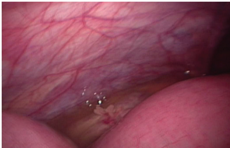
Figure 3. Ascitic fluid.