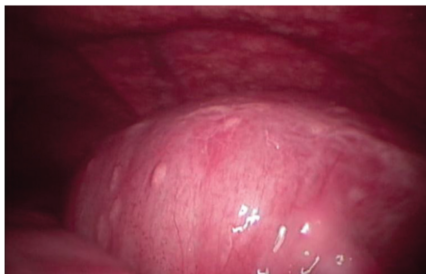
Figure 1. Miliary tubercles on the intestinal wall and abdominal wall.