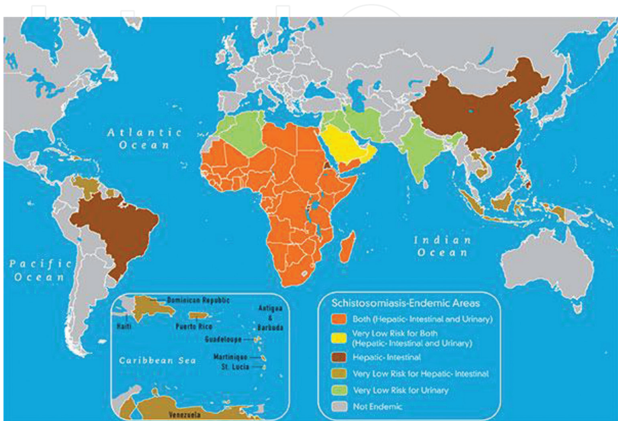
Figure 1. Map of the current global distribution of schistosomiasis.