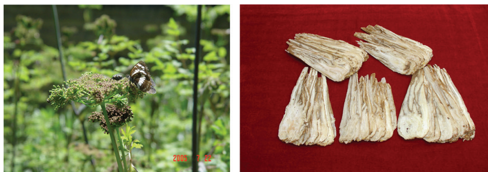
Figure 1. Photographs of A. sinensis .

A. sinensis is the root of A. sinensis (Oliv.) Diels (Umbelliferae family). The genus Angelica is comprised of over 90 species, a total of 45 angelica species are currently distributed in China, of which 32 are endemic [1]. It is mainly cultivated in the southeastern parts of Gansu Province, occurring in Yunnan, Sichuan, Shaanxi and Hubei and showing strong ecological adaptability at altitudes of 1500–2000 m above sea level in China. Photographs of A. sinensis are shown in Figure 1 . As a perennial herb, A. sinensis grows to heights of approximately 0.4–1 m (Flora of China). The whole root is yellowish-brown to brown, about 25 cm long, and irregularly cylindrical with some branch roots stemming from the lower end. The leaves have alternating ovate blades that can range in size between 8 and 18 cm long and 15–20 cm wide. The fruit is elliptical to ovate, and the flowers have 4–7 cm long stems and compound umbels [2].