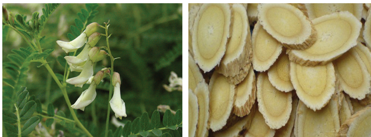
Figure 3. Photographs of A. membranaceus .

A. membranaceus has lobular 13–31 pieces, elliptic or ovate-lanceolate small leaves, length 7–30 mm, width 4–10 mm, corolla light yellow, ovary puberulous, ovate pod oblong 2–2.5 cm and apex beaked with a black undercoat ( Figure 3 ). It grows on sunny hillslopes, sandy riverbanks or shrub edges. This species is found in Heilongjiang, Jilin, Liaoning, Inner Mongolia, Tianjin, Beijing, Shanxi, Gansu and other places [22]. Moreover, both species are cultivated in the Northeast China, and they are gathered in the spring and autumn.