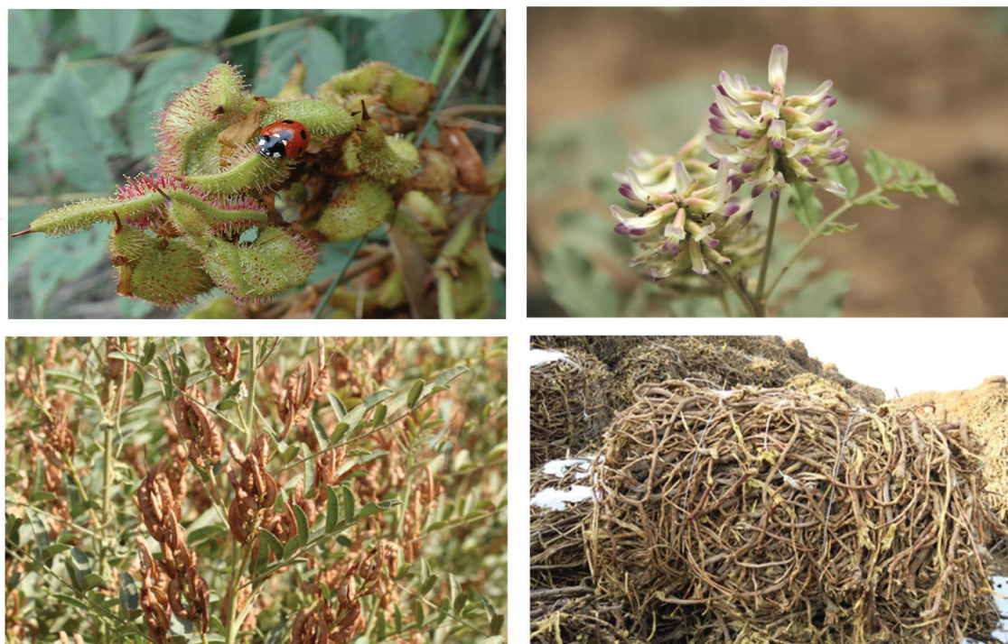
Figure 5. Photographs of G. uralensis are shown.