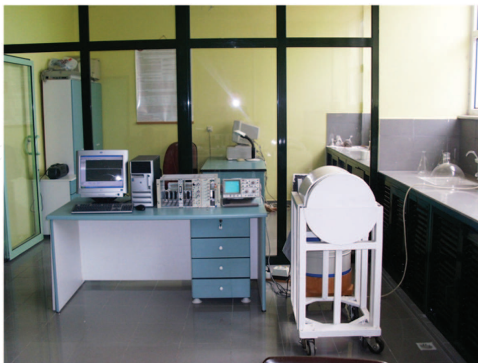
Figure 1. General appearance of the gamma-ray spectrometry system.

electric field, this produced electric field sweeps the electron-hole pairs toward detector contacts. These swept electron-hole pairs are collected by preamplifier. The collected electron-hole pairs in the preamplifier are converted to a voltage pulse with a field effect transistor (FET). The amplifier changes the shape of the voltage pulse. This shape of the pulse increases linearly with the size of the incoming pulse. The analog-to-digital converter converts from the analog structure to the digital structure. The multichannel analyzer (MCA) sorts the pulses according to pulse height in addition; MCA counts the number of pulses in the individual pulse height ranges. Computers are used to check the measurements and to record the spectrum in modern gamma-ray spectrometers. The advantage of such systems is providing great convenience to users in fulfilling their various data-analysis calculations during and after measurement. During the measurement, the location and area of the peak of interest via a program used can be determined on screen, therefore, the collection rate of counting and the identity of radionuclide can be determined.