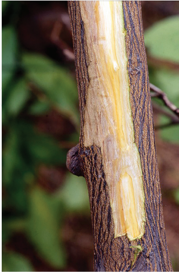
Figure 2. Pink-salmon discoloration of the wood associated to mal secco disease.