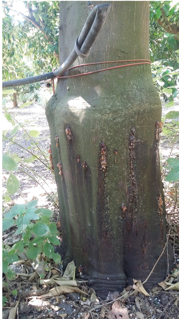
Figure 13. Trunk gummosis caused by Phytophthora citrophthora on a citrus tree.

parts of the tree, including roots, stem, branches, twigs, leaves and fruits. There are several forms ( facies ) of Phytophthora diseases including root rot, foot rot ( Figure 13 ) (also known as Phytophthora gummosis, trunk gummosis or collar rot), fruit brown rot ( Figure 14 ), twig and leaf dieback (often indicated collectively as canopy blight) and rot of seedlings (better known as damping off of seedlings). Trunk gummosis and root rot are the most serious facies of this group of diseases, and after the pandemic outbreak of the nineteenth century and the consequent widespread use of resistant rootstocks, they are regarded as endemic diseases in all citrus-growing areas of the world.