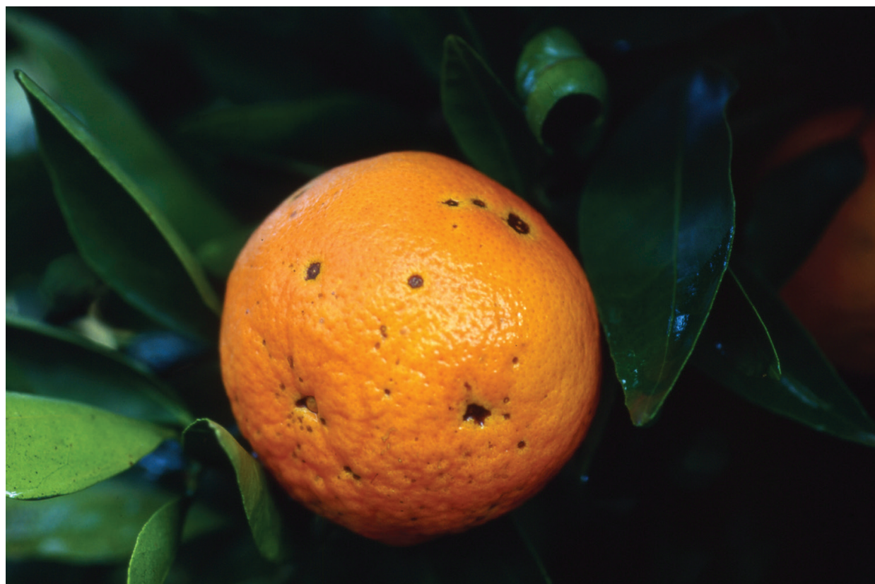
Figure 7. Alternaria brown spot on 'Nova' tangelo hybrid.