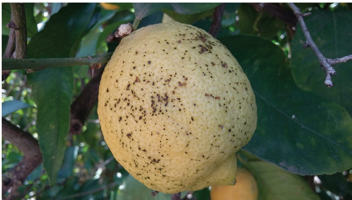
Figure 8. Typical symptoms of Septoria spot on a lemon fruit.

cool, frosty or cold windy weather. The susceptibility of fruits is related to the maturity of the rind at the time of infection. Management practices to prevent or reduce the disease incidence and severity include tree skirting and canopy pruning to improve air circulation, early fruit harvesting and the removal of withered twigs from the tree canopy and fallen leaves from the soil under the tree canopy to reduce the amount of inoculum. Copper sprays in late fall or early winter to control fruit brown rot caused by Phytophthora citrophthora are also effective against Septoria spot.