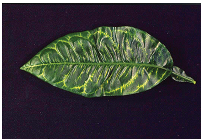
Figure 3. Clearing and chlorosis of a sour orange leaf affected by Plenodomus tracheiphilus.