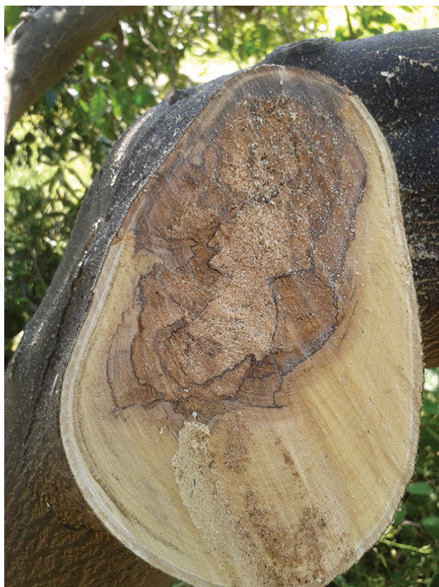
Figure 11. Symptoms of wood rot caused by Fomitiporia mediterranea on Citrus sp..

F. mediterranea is a ubiquitous and polyphagous species, commonly found also on other fruit, ornamental and forest tree species, such as hazelnut, olive, kiwi, locust tree and privet. On grape, it is associated to 'Esca' disease. It is assumed that most infections in citrus orchards originate from airborne basidiospores germinating on large pruning wounds of trunk and main branches. Basidiospores produced by basidiomata germinate with relative humidity over 90% and are dispersed by wind. Usually, basidiomata ( Figure 11 ) emerge from the bark after the wood of trunk or branches has been extensively colonized by the fungus ( Figure 12 ). In Southern Italy, the analysis of F. mediterranea internal transcribed spacer (ITS) sequences revealed a high level of genetic variability, with both homozygous and heterozygous