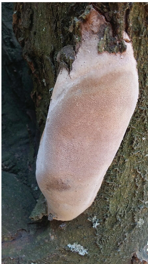
Figure 12. Basidiocarp of Fomitiporia mediterranea.

genotypes. This and the high frequency of basidiomata in old commercial orchards confirm the outcrossing nature of reproduction in F. mediterranea and the primary role of basidiospores in the dissemination of inoculum. Prevention is the only way to manage wood rots. Trees should be kept healthy and vigorous. Large pruning cuts, or other wood-exposing injuries, should be avoided, especially during wet periods. Proper management guidelines include sanitation of pruning cuts with mastics to prevent the penetration of the pathogen.