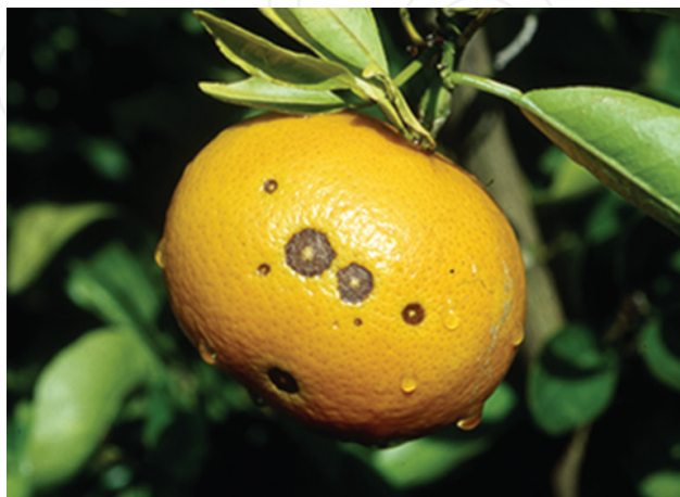
Figure 6. Typical symptoms of Alternaria brown spot on 'Fortune' mandarin.

areas and semi-arid regions provided a susceptible citrus variety is present. Fruits can get infected in all development stages but are more susceptible during the first four months following petal fall. Spring infections on young fruits may lead to premature fruit drop. Early fruit drop is common, especially if infection has occurred shortly after petal fall. Symptoms on fruits are necrotic brown circular lesions that may vary in size ( Figures 6 and 7 ). Mature