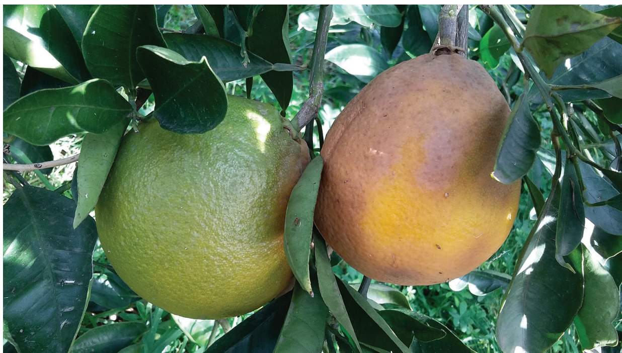
Figure 14. Sweet orange fruit with symptoms of brown rot caused by Phytophthora citrophthora.

gummosis. Other species found occasionally include Phytophthora citricola , Phytophthora cactorum , Phytophthora hibernalis and Phytophthora syringae . The last two species are found during winter months solely because of their low-temperature requirements.