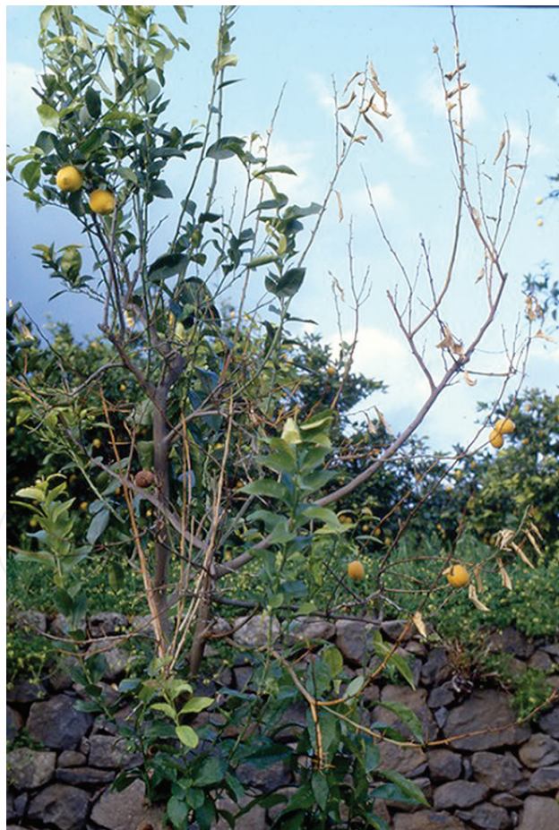
Figure 1. Wilting, leaf shedding and defoliation on a young lemon tree affected by mal secco.

The mal secco, an Italian name meaning “dry disease”, is a vascular wilt disease ( Figure 1 ) caused by the mitosporic fungus Plenodomus tracheiphilus ( P. tracheiphilus ), formerly Phoma tracheiphila . Symptoms include strands of salmon-pink to orange-red discoloration visible in stem xylem ( Figure 2 ) as well as veinal chlorosis ( Figure 3 ), wilt and shedding of leaves, dieback of twigs and branches. The disease is particularly destructive on lemon ( Citrus limon ) in Mediterranean countries and the Black Sea region. So far, however, it has not been reported in Spain, Portugal and Morocco, as well as other major citrus-growing regions of the world, even though there is no obvious climatic or cultural factor limiting its establishment in uninfested areas.