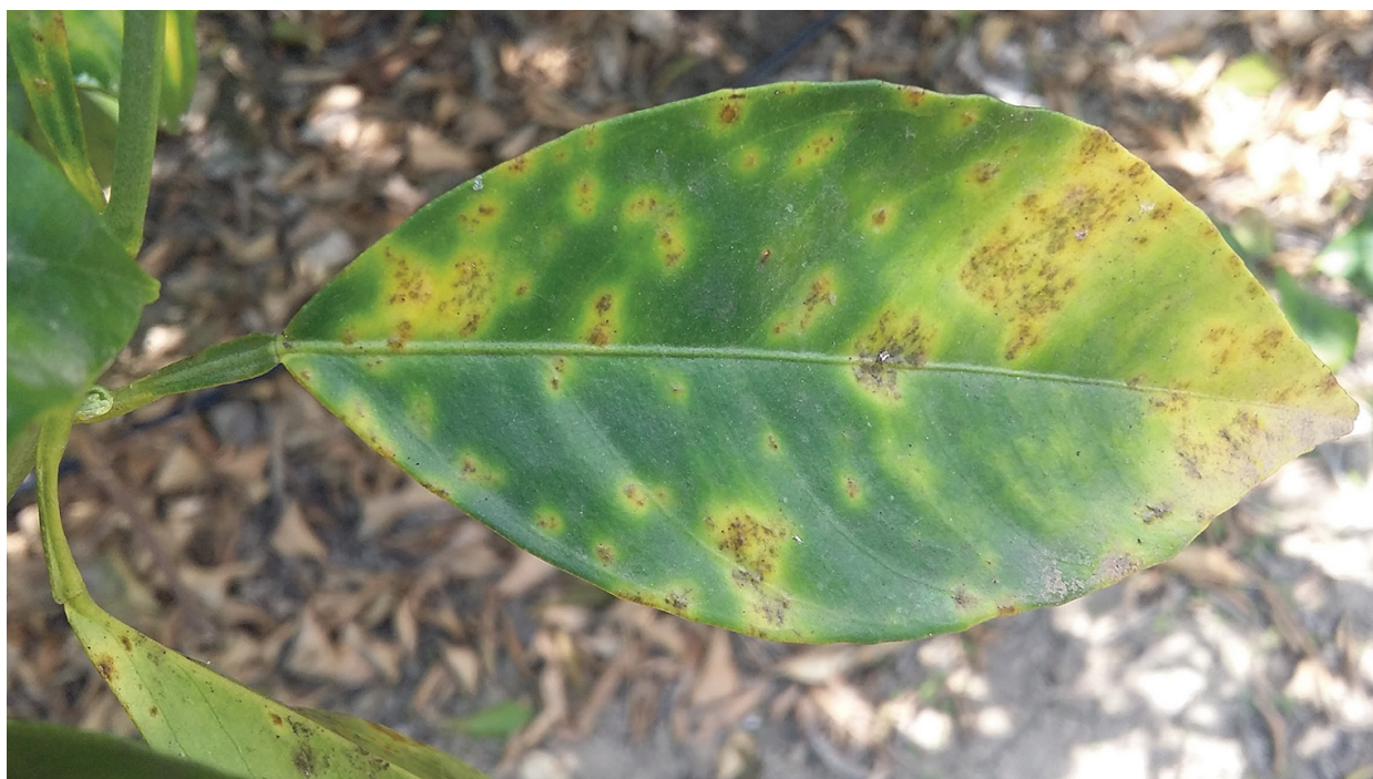
Figure 9. Symptoms of foliar greasy spot on the upper leaf surface of sweet orange.

During the last years, an epidemic outbreak of a foliar disease closely resembling greasy spot has been observed in some citrus-growing areas of western Sicily (Italy). Symptoms appear on mature leaves and range from those typical of greasy spot ( Figures 9 and 10 ) to black dots. Premature leaf drop occurs and causes heavy defoliation of the tree.