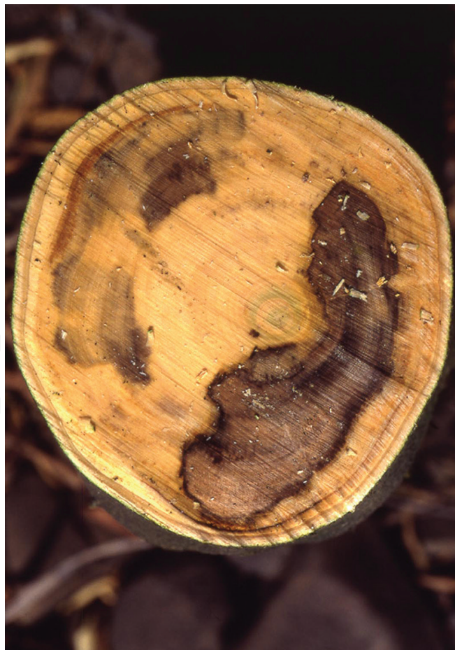
Figure 4. The ‘mal nero’ facies of mal secco disease.