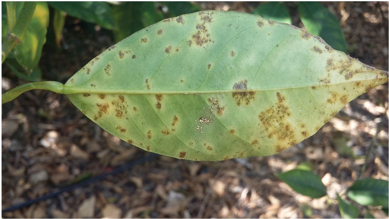
Figure 10. Symptoms of foliar greasy spot on the lower leaf surface of sweet orange.

The analysis of the fungal community using an amplicon metagenomic approach has revealed that Mycosphaerellaceae were the dominant group of fungi, in both symptomatic and asymptomatic leaves, and were represented by the genera Ramularia , Mycosphaerella and Septoria , with about 44, 2.5 and 1.7% of the total detected sequences [39]. The most abundant sequence type was associated to Ramularia brunnea , a species originally described to cause leaf spot in a plant of the family Asteraceae. Surprisingly, none of the detected sequences clustered with reference species currently reported as possible causal agents of greasy spot. Results are not conclusive and the aetiology of this emerging disease is still unresolved.