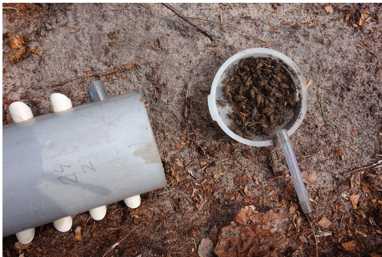
Photo 5. Hylobius abietis beetles collected by IBL-4 trap, visible dispenser in the form of tube filled with synthetic attractant.