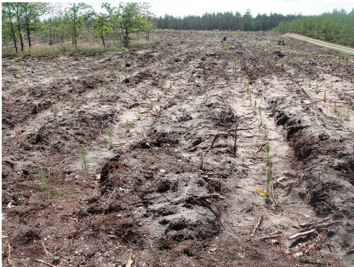
Photo 1. Typical Pinus sylvestris plantation in Poland.

Forests can be susceptible to insect attacks at all stages, and forest plantations newly established on clear-cuts left after harvesting of old stands facilitate the concentration of insects associated with specific stand ages ( Photo 1 ). In Poland, weevils (Coleoptera: Curculionidae) represent the most important group of pest insects of 1–5-year-old forest plantations established on clear-cuts [7–9]. The aim of this paper is to present the most important insect species damaging forest plantations and their management, including methods to estimate and reduce their numbers.