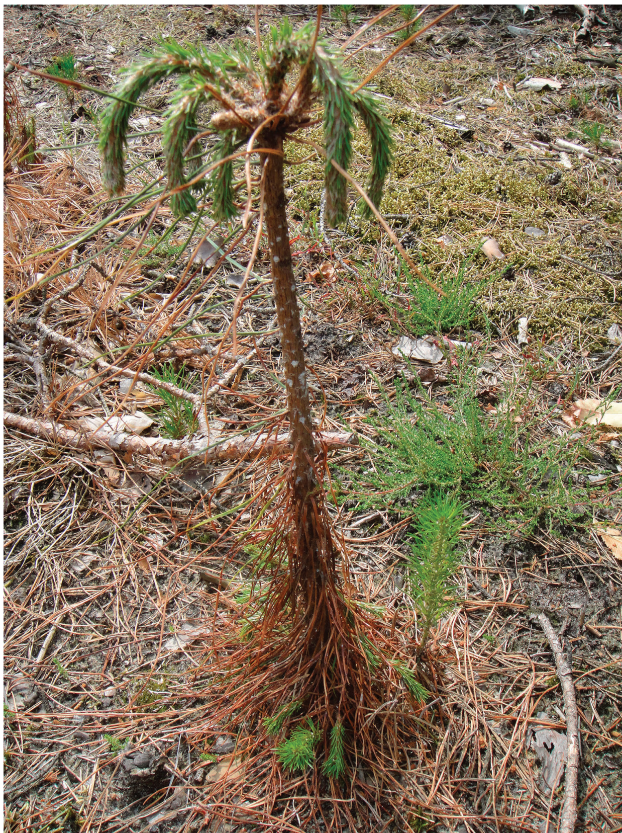
Photo 2. Pinus sylvestris seedling with the characteristic symptoms of the colonization by Pissodes castaneus : leaks of resin on a stem, hanging top shoots.