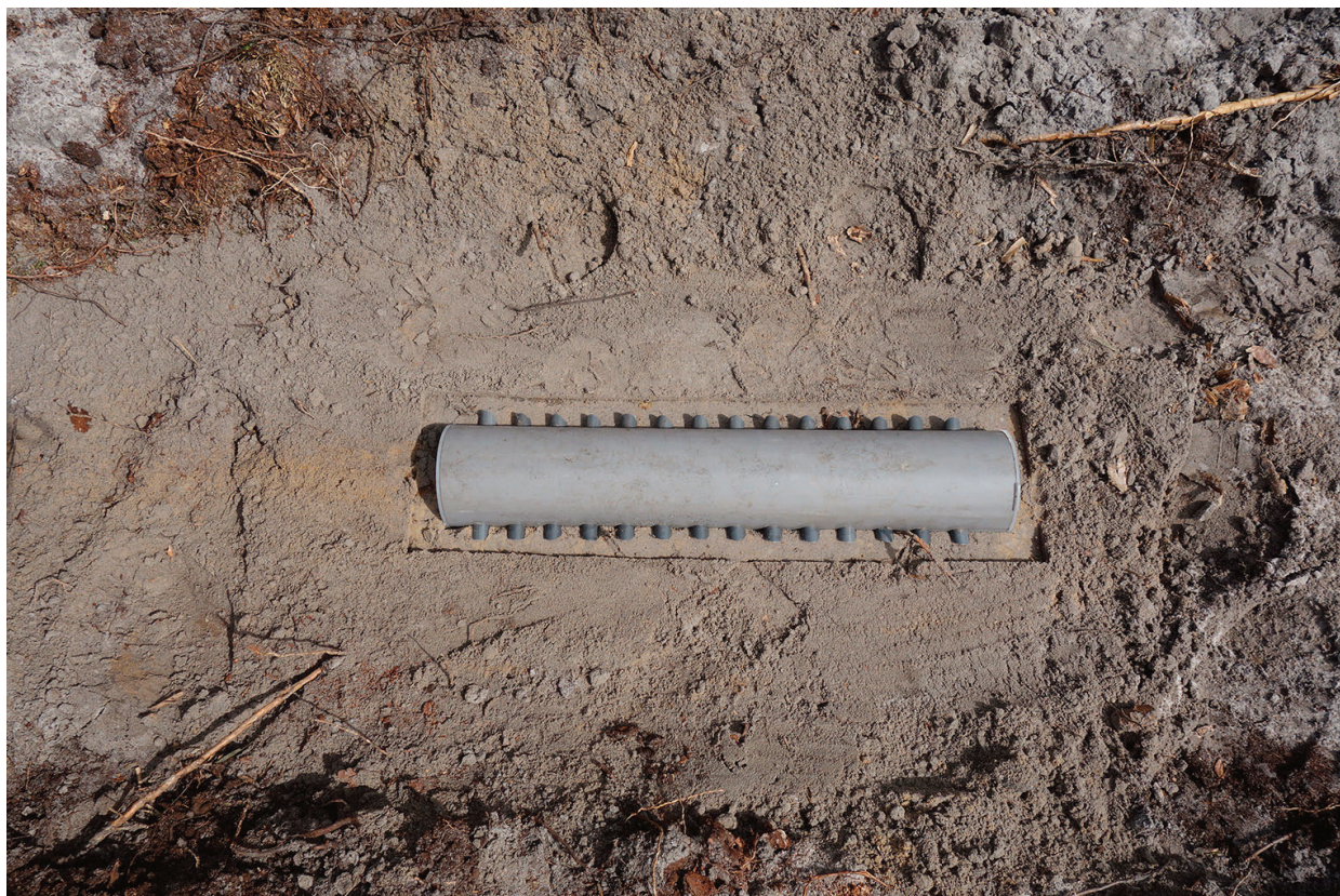
Photo 4. IBL-4 trap used for collection of Hylobius abietis beetles.

of the threat depends on the age of the trees and is critical for 3–10-year-old forests, when the number of eggs reaches, respectively, 50–1,500 per tree. Evaluation of threats by Tortricidea spp. is based on the estimation of the number of pine buds or higher shoots damaged by larvae. It is generally carried out from May 15 to June 15 and consists of the observations of 30 trees growing on the edge and 30 trees growing in the center of the forest. Critical damage is defined as damage of at least 30% of buds or shoots. A complementary method of Rh. buoliana observation involves the counting of butterflies attracted by pheromone traps installed before the start of swarming in the second half of June ( Table 2 ).