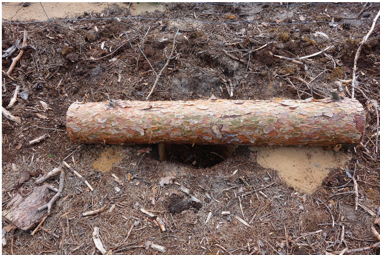
Photo 3. Pinus sylvestris billet used for protection of reforestations; under the trap there is a hole to collect Hylobius abietis beetles.

Evaluation of the number of P. castaneus and the level of damage to P. sylvestris plantations and thickets is performed on the basis of the number of trees colonized by the pest on areas of its occurrence in the previous years and in young forests weakened by biotic (fungi, insects, deer) and abiotic (drought, hail, fire) factors. The observations are performed every two to three weeks from mid-May to the end of September.