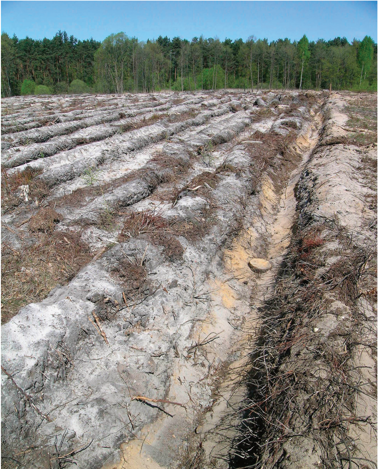
Photo 6. Plantation surrounded by groove with slice of pine wood to collect pest beetles.

captured nontarget insects belonged to the family Carabidae, which entered the traps accidentally or on the search for shelter. Beetles from the families Dermestidae, Geotrupidae, and Silphidae that feed on dead insects were probably attracted by the smell of decomposing insects inside the traps. Removal of stumps from the clear-cuts can reduce populations of