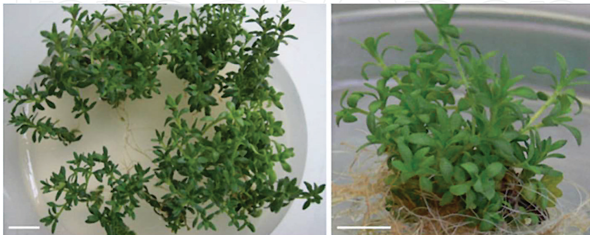
Figure 2. Thymus caespititius multiple shoots produced. (A) Outgrowth of the axillary buds maintained on MS medium with 0.4 \text{ mg L}^{-1} BA and 0.1 \text{ mg L}^{-1} IBA. (B) Detail of spontaneous root formation in shoot cultures (bars = 1 cm) [43].

Optimizations for micropropagation process involve the use of different growth regulators like cytokinins, auxins, or gibberellic acid for the induction of multiple shoots. The first works in Thymus micropropagation are from Furmanowa and Olszowska dated from 1980 [38] to 1992 [39]. Since that date, a lot of works for the micropropagation of different species of Thymus (Table 1), as well as the cryopreservation of the same plants, were developed (Figure 2).