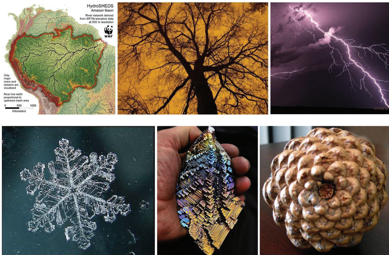
Figure 1. Pattern of river networks, lightning bolts, trees, snowflakes, metal crystals, and pinecones.

The second law of thermodynamics can be stated as follows, "In an isolated system, entropy never decreases." The second law of thermodynamics is just another way of saying that all physical systems tend to move toward their most probable states, which shows up as increased entropy. Viewed in that context, entropy can be thought of as measuring disorder or randomness. The Universe is governed by entropy and constant changes and growing toward greater and greater disorder. Yet, chaos is not simply disorder. Chaos explores the transitions between order and disorder, which often occur in surprising ways. An order arises from the ever-growing disorder of the Universe—chaos and order together. Let us take a close look at nature in Figure 1 .