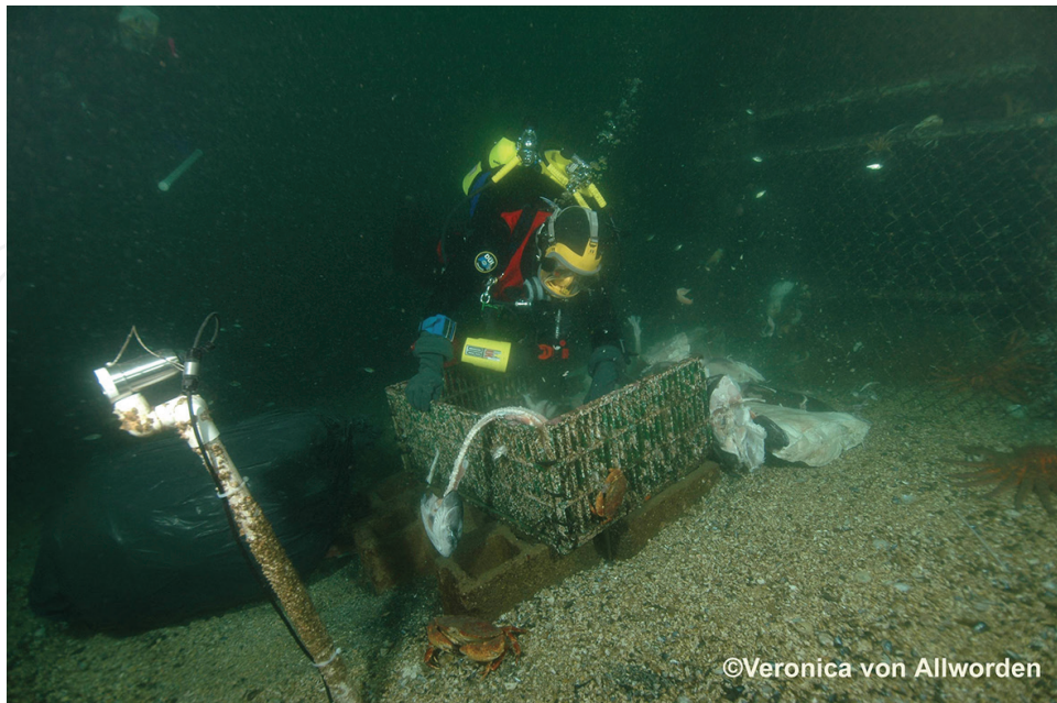
Figure 3. SCUBA diver setting bait to attract free swimming sixgill sharks at the Seattle Aquarium for genetics and abundance research.

the Aquarium Conservation Partnership (ACP) launched in 2016 as a 2-year-proof-of-concept project designed to bring the nation's leading aquariums together to achieve meaningful