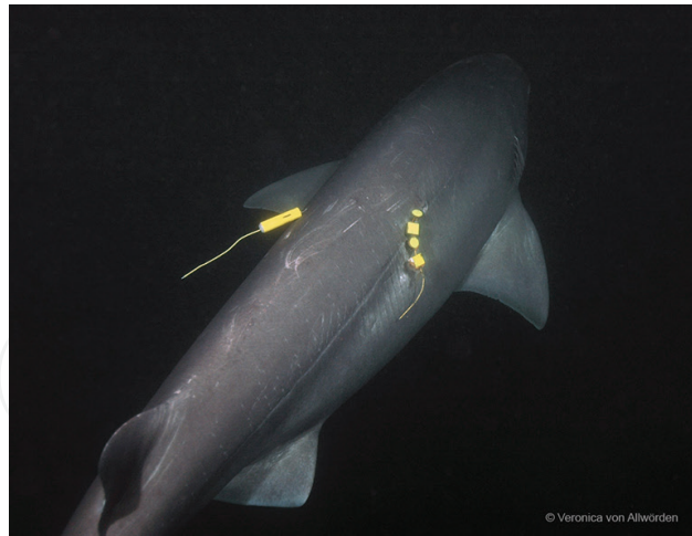
Figure 4. Free swimming sixgill shark with visual marker and acoustic tag for movement and abundance research under the Seattle Aquarium.