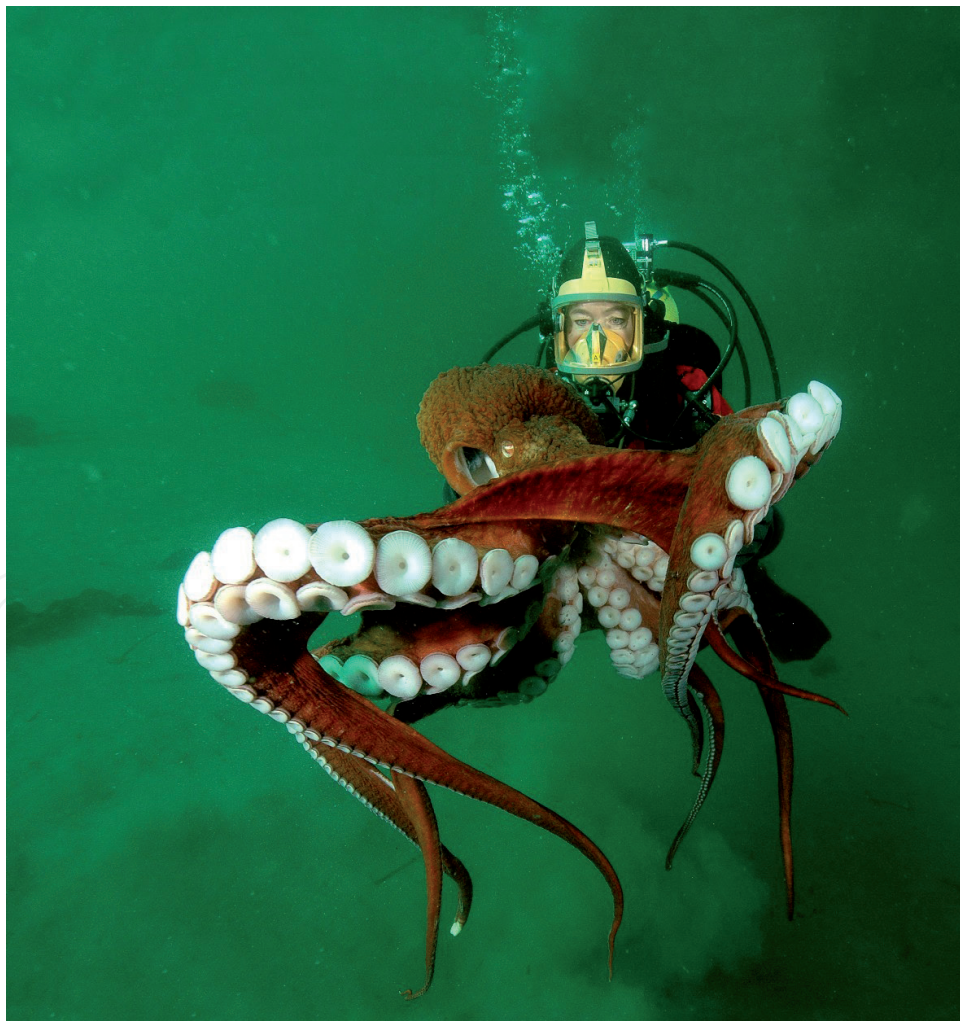
Figure 5. SCUBA diver conducting population surveys on giant Pacific octopuses.