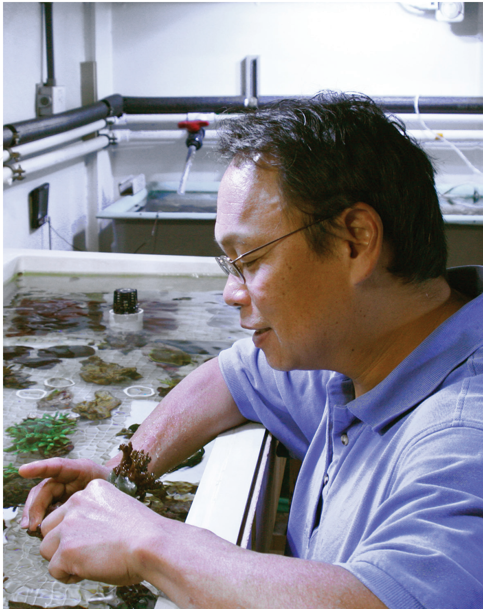
Figure 1. Coral research: Seattle Aquarium biologists growing corals for display and to share with other aquariums to minimize taking of wild corals.

Zoos and Aquariums are doing more for wildlife conservation and they may have the greatest conservation impact when they work together. In 2015 AZA launched a conservation initiative called Save Animals from Extinction or SAFE. The initiative is to encourage accredited zoos and aquariums to harness their collective resources, focus on specific endangered species, and save them from extinction by restoring healthy populations in the wild. AZA SAFE focuses on 10 signature species/groups of animals: African penguin, Asian elephant, black rhinoceros, cheetah, gorilla, whooping crane, sea turtle, sharks, vaquita, and Western pond turtle. Many of the major aquariums in Table 2 listed conservation projects that involved either sharks and/or sea turtles as many aquariums have sharks in their collections and many either have sea turtles or participate in sea turtle rehabilitation. Another collaborative conservation initiative,